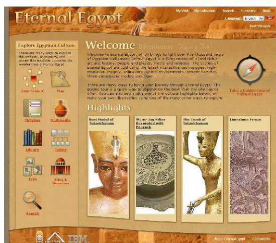
Fig 6 : The homepage for www.eternalegypt.org

Within this website, one can investigate several collections that are present in different museums. For the Pharaonic period one can investigate the collection at the Cairo museum and the Luxor museum. For the Greco-Roman period the collections of the Greco-Roman museum in Alexandria can be viewed, for the Coptic period the collections of the Coptic museum in old Cairo (Fustat) can be explored and finally for the Islamic period the collection of the Islamic art museum in Cairo can be examined.