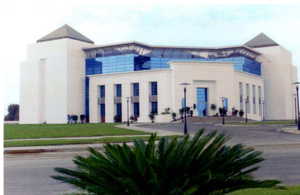
Fig 1: The Center for Documentation of Cultural and Natural Heritage building, Smart Village, Egypt

Egypt's wealth in archeological sites, architectural styles, arts, folklore and natural beauty is reflected in CULTNAT's various programs as follows: