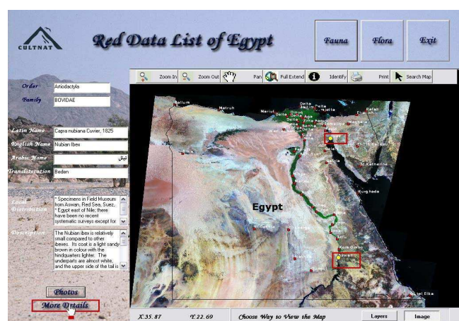
Fig 4 & 5 : The Natural Map of Egypt