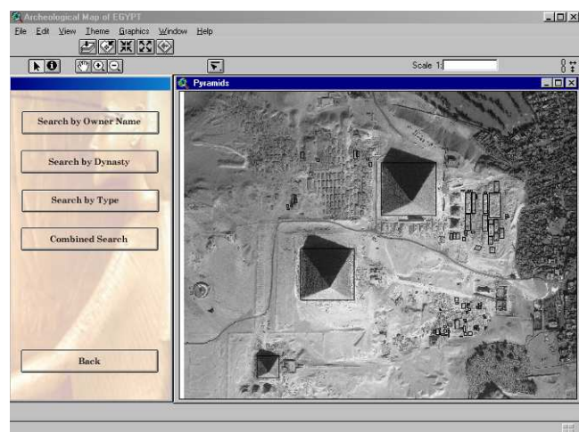
Fig 2 & 3 : The Archeological Map of Egypt : levels 1 and 2