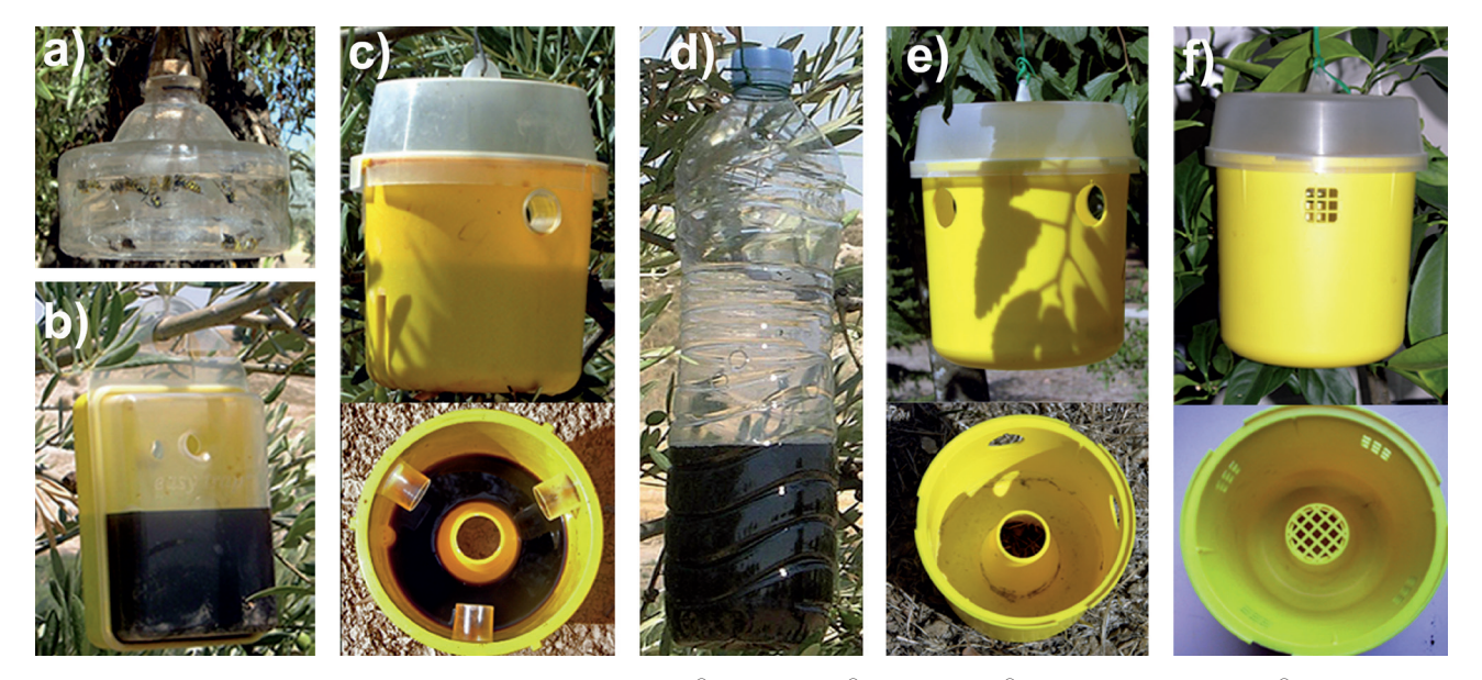
Figure 2. Trapping devices used in the field trials: a) McPhail<sup>®</sup>; b) Easy trap<sup>®</sup>; c) Probodelt<sup>®</sup>; d) Olipe; e) Tephri-trap<sup>®</sup>; f) Tephri-trap Ecological<sup>®</sup>.

Trapped arthropods were collected by filtering the bait when it was replaced. Specimens were determined to family level at the Instituto Nacional de Investigación y Tecnología Agraria y Alimentaria (INIA), Madrid, Spain. The majority of the captured tachinids were sent for determination to the first author, at the Staatliches Museum für Naturkunde (SMNS), Stuttgart, Germany.