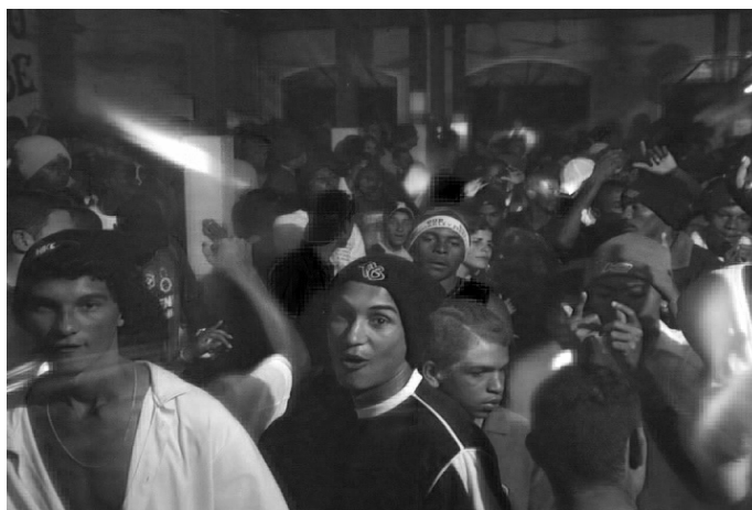
Fig 3: Baile funk as filmed by Denise Garcia in 2005