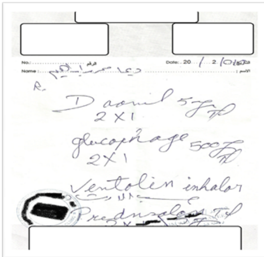
Figure 1. Prescription containing 4 medicines for patient with asthma and diabetes.

A simulated patient in which a patient's prescription for antidiabetic and antiasthma medications was used in order to evaluate the reaction of the community pharmacist towards this prescription. The prescription included the following medications as shown in figure 1; Donil® (glibenclamide) 5 mg, Glucophage® (metformine) 500 mg, Ventolin® (salbutamol) inhaler, Prednisolone 5mg. This prescription was prescribed to a patient suffering from both asthma and diabetes mellitus. One hundred and ninety four pharmacies were visited by a simulated patient in order to dispense the prescription taking into consideration the following areas in the UAE; Abu Dhabi, Dubai, Sharjah, and Fujairah. The research was intended to cover every accessible pharmacy in those areas within the time frame of the study. The study was carried out in the period between January and April 2010. One of the research team went as a simulated patient. This person visited the pharmacies in order to dispense the prescription. Once the pharmacist delivered all of the medications, the researcher assessed the behavior of the pharmacist according to Performance assessment sheet shown in table 1. The prescription was missing certain information such as the duration of treatment, directions for use, age and also prednisolone was a medication error which may worsen diabetes mellitus.