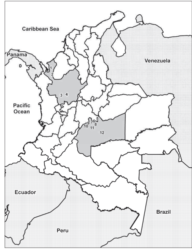
Figure 1. Map of Colombia showing the provinces and approximate location of sampling sites. Province of Antioquia: 1 Turbo; 2 Chigorodó; 3 Bolombolo; 4 La Ceja. Province of El Meta: 5 Paratebueno; 6 Cumaral; 7 Restrepo; 8 Villavicencio; 9 Acacias; 10 Guamal; 11 Castilla; 12 San Martín.

WNV-neutralizing antibodies have been detected in birds captured in Jamaica, Dominican Republic, Puerto Rico, Cuba and Guadeloupe (Dupuis et al. , 2003; Komar et al. , 2003; Dupuis et al. , 2005), and in horses from México (Lorono-Pino et al. , 2003), Argentina (Morales et al. , 2006), Venezuela (Bosch et al. , 2007) and Guatemala (Morales-Betoulle et al. , 2006). First reports in Colombia appeared in 2005 and included equines from the northern coastal areas (Mattar et al., 2005; Berrocal et al. , 2006). Here are we extended these studies in equines from two Colombian provinces, Antioquia and El Meta, located in the northwestern and central-eastern regions of the country, respectively (Figure 1).