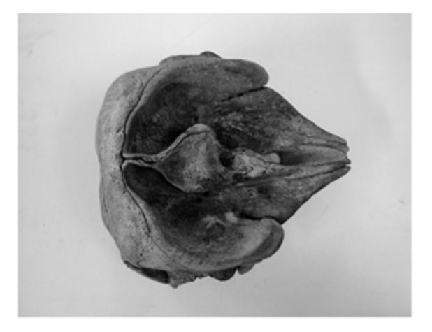
Figure 3. Partial skull of second specimen of Kogia sima recorded for Venezuela (1998). Found on the coasts of Falcon State in western Venezuela (11°03,367'N; 71°06,193'W)

To confirm or rule out of the species K. sima for both samples, the comparative averages obtained when associating the percentages of the value data of the rostrum length (RL) with the condylo-basal length (CBL), based on the methodology employed by Ross (1979) were used as a key instrument for identification.