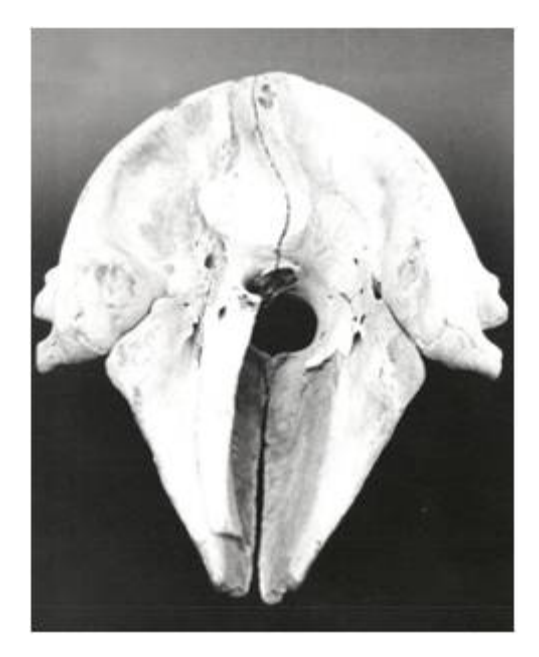
Figure 2. Skull of first specimen of Kogia sima recorded for Venezuela (1998). Found dead in Zulia State, Páez Municipality (11° 50,717' N; 71° 20,633' W)

By the year 2001, the species Kogia sima (Family Kogiidae) was reported for the first time in Venezuela based on the study of a skull found in 1998 in the northwest coast of Zulia State, Páez Municipality, in western Venezuela (11° 50,717' N;