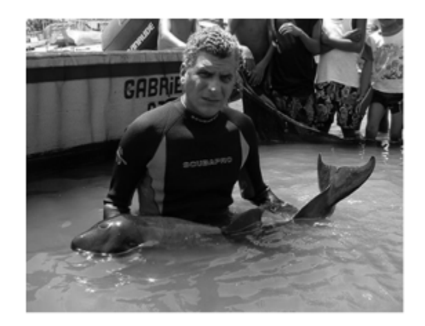
Figure 5. Specimen of Kogia sima stranded live on La Punta Beach (10° 53,28'N; 64° 03,616'W), El Guamache sector, to the southeast of Margarita Island (2001)

the Caribbean and northeastern Atlantic (Debrot and Barros, 1994; Perez-Sayas et al. , 2002; Alardo et al. , 2007). It is also the first reported evidence of wounds inflicted by cookie cutter sharks on any cetacean stranding case documented in the country (Figure 6).