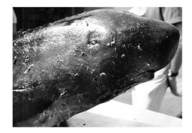
Figure. 4. Young specimen of Kogia sima found four miles from Bajo San Bernardo, near San Carlos Island, in Municipality Almirante Padilla of Zulia State, (11° 02,185' N; 71° 41,061' W).

Results demonstrated that the percentage of dorsal fin's height in comparison with the total body length of the specimen was 7.4%, exceeding the 5% established for K. sima (Jefferson et al. , 1993).