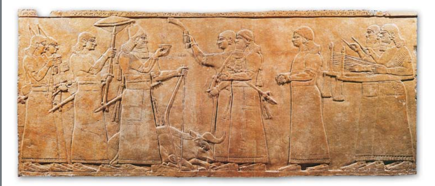
Figure 3. Celebration after a bull hunt