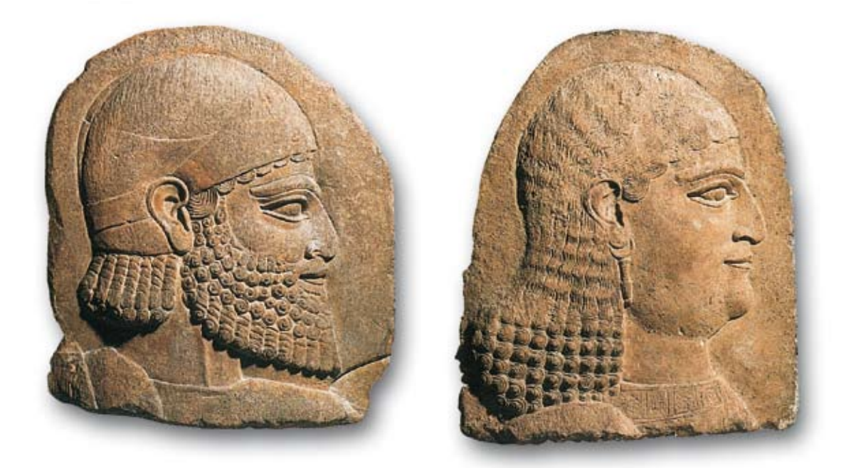
Figure 7. Head of a bearded man

Like his father Tiglath-pileser III, Sargon II (721-705 BC) spent much of his reign on campaign. He had claimed the throne from his brother, Shalmaneser V (726-722 BC), probably in a violent coup, and completed the conquest of Samaria, capital of the kingdom of Israel which was turned into an Assyrian province. However, Assyria continued to face pressure from neighbouring powers: Babylonia made an alliance with Elam in southwest Iran throwing off Assyrian authority and, at the same time, Urartu continued to threaten Assyria, establishing links with Phrygia which dominated central Anatolia under king Midas. In 717 BC a revolt in Carchemish intigated by Midas was crushed by Sargon and vast amounts of booty from the great trading city was carried to Nimrud and stored in the refurbished Northwest Palace. In 714 BC Sargon led his army into Uratian territory, plundering the wealthy frontier state of Musasir, and four years later he reclaimed the throne of Babylon.