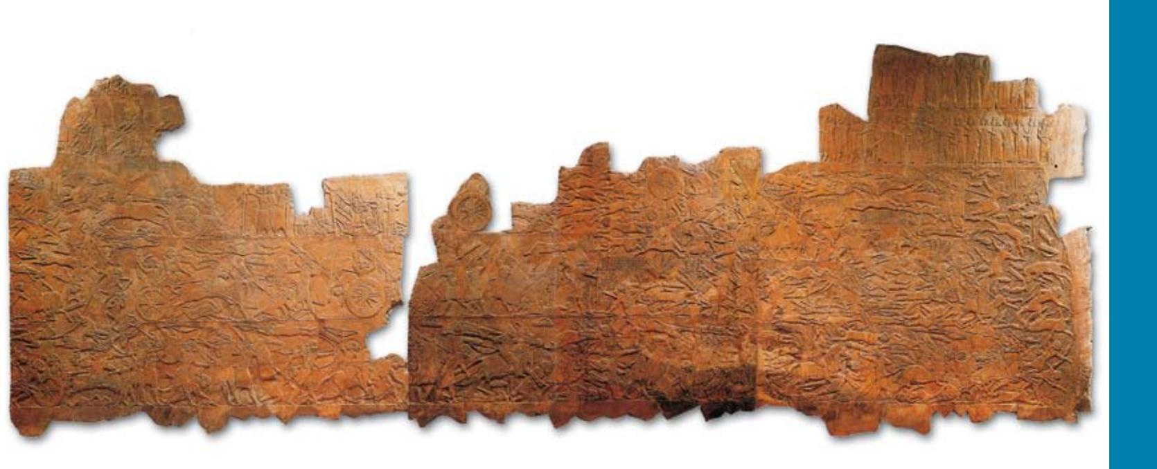
Figure 11. The Battle of Til- Tuba

bearer. The latter wears a distinctive headband with long ear-flaps, an almost identical uniform to that worn by the men of Lachish.