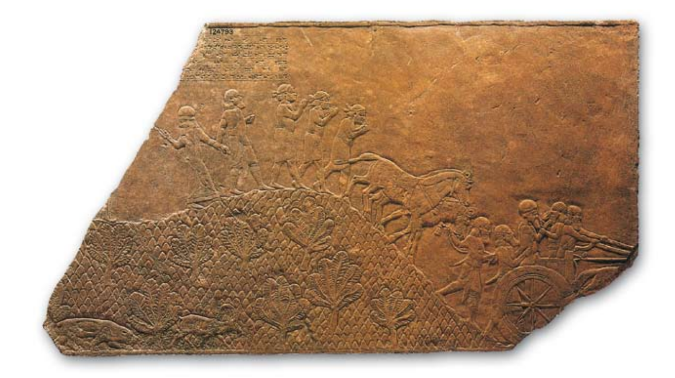
Figure 12. The capture of an Elamite King

Sennacherib. The throne room was decorated with scenes of Ashurbanipal's triumphs in Elam (Figure 12) placed opposite scenes of victories in Egypt and which thus stood for the extent of the empire from East to West. As in his grandfather's reliefs, the king is never shown engaged in fighting and indeed Ashurbanipal is entirely absent from the battle scenes. This probably reflects the real situation but, although literalness has become an important element of the reliefs, the imagery continues to be heavily selected. There is an increasing interest in the suffering and humiliation of the enemy rather than a focus on the activities of the king whose main role is to receive defeated people and booty.