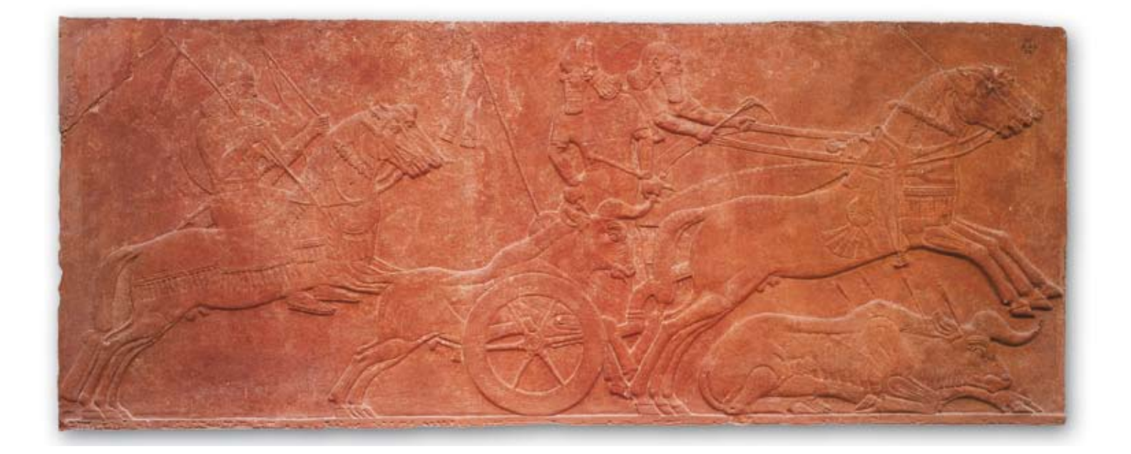
Figure 1. Royal bull hunt

The first Assyrian king to use relief decoration extensively was Ashurnasirpal II (883-859 BC). When he ascended the throne of Assyria the kingdom was already established as the dominant power in northern Iraq and eastern Syria. The king probably resided at Nineveh but in 879 BC he selected the site of Kalhu (modern Nimrud), an ancient settlement beside the river Tigris, to become his royal centre. Subject rulers, especially in the mountains to the north and east of Assyria, were required to supply him with workers and materials, and vast numbers of people were drafted in to undertake the building work. City walls were constructed enclosing an area of some 360 hectares and a canal was built to water orchards and gardens planted with exotic trees and plants gathered from distant regions and symbolizing the extent of the king's realm. The most impressive buildings were erected on the old settlement mound which was cleared for the construction of temples and Ashurnasirpal's principle residence, known today as the Northwest Palace. It was an enormous building more than 200 metres long and 118 metres wide with state apartments, offices and private apartments organized around separate courtyards.