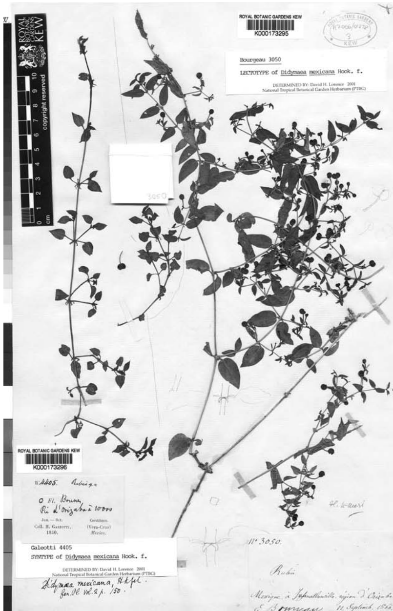
Fig. 2. Lectotype of Didymaea mexicana Hook. f. (right hand collection, Bourgeau 3050, K).