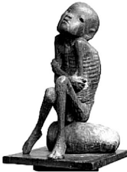
Figure 3. “Resigned,” 1971, by Antonio Pujía. Private Collection, Sydney, Australia.

...a culture of the difference has arisen: the minority values and perspectives, until now ignored [...] we are in front of the loss of the dominant speech. [...] This crisis questions and reveals the system of binary