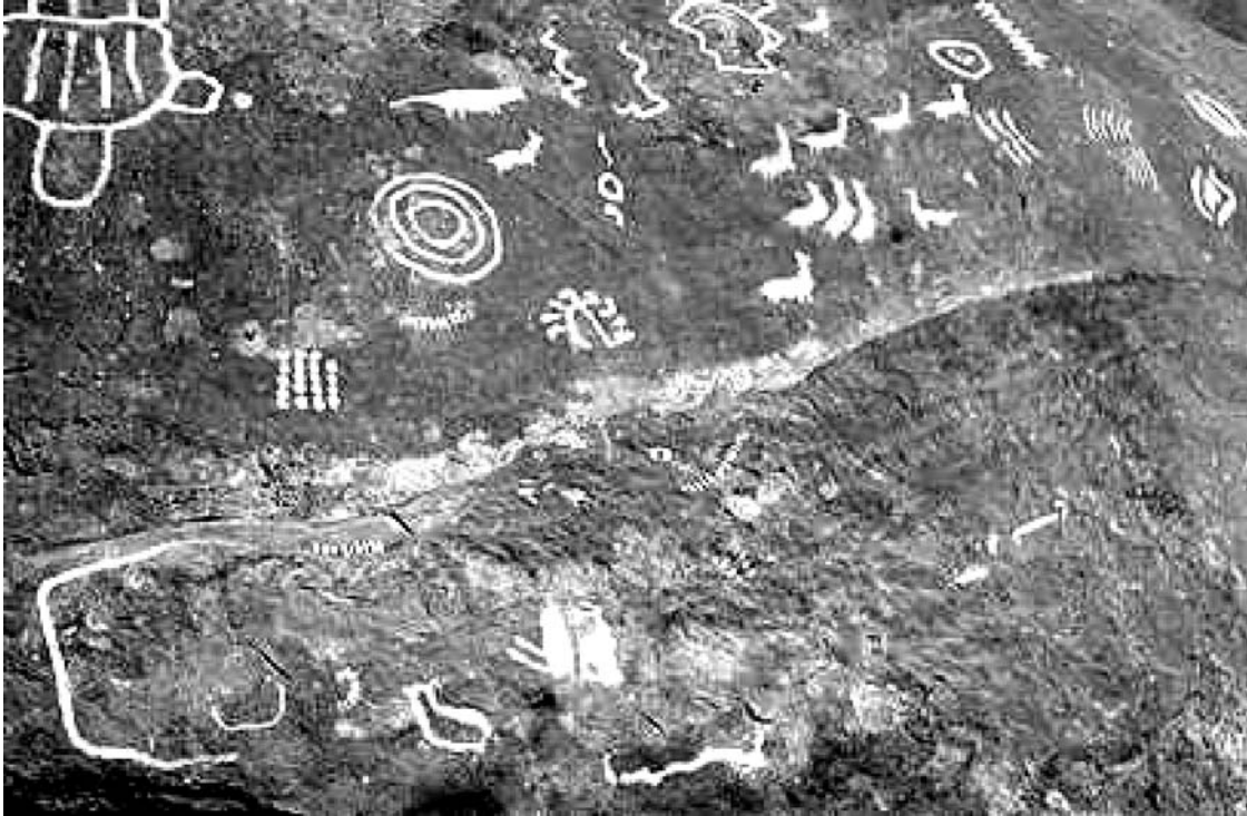
Figure 1. Mural details of Inti Huasi. Cerro Colorado, Córdoba, Argentina.

Originally, the stories compiled in the Popol-Vuh were a combination of hieroglyphic writing and paintings. Subsequently, they were translated into the Quiché language, but using the Roman alphabet, by a Mayan in 1558. Because the Spanish soldiers and missionaries were destroying sacred books, the manuscripts comprising the Popol-Vuh were hidden. At the beginning of the 17 th century, father Francisco Ximénez found these manuscripts in a church, in Santo Tomás of Chichicastenango, and translated them into Spanish under the name of Book of the Council . Here is how the author of this ancient document described it: