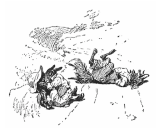
Figures 6 and 7: These are two images of the tale. In the first one Brer Rabbit is getting furious because of not being greeted back. In the second one Brer Fox is laughing at the sight of Brer Rabbit stuck in tar.

The continuation of this tale is "How Mr Rabbit Was too Sharp for Mr Fox". Brer Rabbit, caught by Brer Fox, uses what is called "escape by false plea". The trick consists in accepting all kinds of punishment except one. Brer Rabbit pretends he is afraid of being thrown to the brier patch. He asks Brer fox to be punished in any way except the brier patch. Of course the wicked mind of Brer Fox decides to impose the worst punishment so Brer Rabbit is thrown to the brier patch. Brer Rabbit has got what he wanted because, although full of adversities, the brier patch is the place where he was born and where he had learnt to survive: