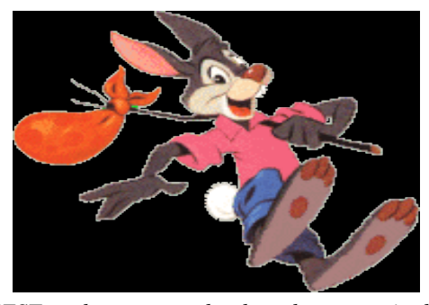
Figure 5: "TAIN'T THE BIGGEST en de strongest dat does de mostest in dis world." "De elephen may be strong; I speck he is; en de tiger may be servigorous ez dey say he is; but Brer Rabbit done outdone bofe un um" (Friends:52)

In these stories animals steal food from one another, lie, cheat, trick etc.; however, they observe the social rules: they speak to each other as neighbours whenever they meet, they take meals together, they start communal projects and go together to court "Miss Meadows and de gals" (who supposedly represent prostitutes). Power, food, and sex are the main topics of the book. The major characters are Brer Rabbit, Brer Fox, Brer Bear, Brer Wolf and Old Man Tarrypin. But there are also other animals such as the frog or the sparrow. However, there is a hierarchy in this animal plantation. The strongest animals, i.e., the fox, the wolf, the bear, the cow and the lion represent the aristocratic and white High Southern Society. But in fact they do not enjoy this status since the weakest animals (the rabbit, the turtle, the frog, the owl, the polecat, the sparrow and the goose) manage to trick them and the system by using their intelligence. Therefore, physical force is not the way to get to the top of this society: