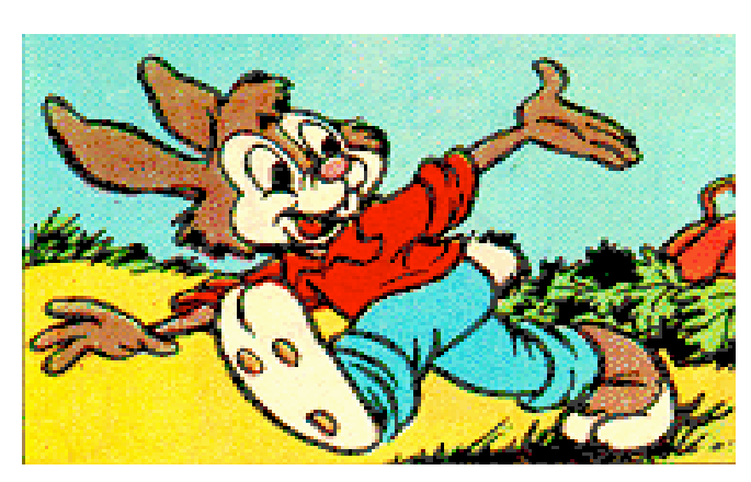
Figure 8: "'Bred en bawn in a brier-patch, Brer Fox--bred en bawn in a brier-patch!' en wid dat he skip out des ez lively as a cricket in de embers." (1986:64)

The continuation of this tale is "How Mr Rabbit Was too Sharp for Mr Fox". Brer Rabbit, caught by Brer Fox, uses what is called "escape by false plea". The trick consists in accepting all kinds of punishment except one. Brer Rabbit pretends he is afraid of being thrown to the brier patch. He asks Brer fox to be punished in any way except the brier patch. Of course the wicked mind of Brer Fox decides to impose the worst punishment so Brer Rabbit is thrown to the brier patch. Brer Rabbit has got what he wanted because, although full of adversities, the brier patch is the place where he was born and where he had learnt to survive: