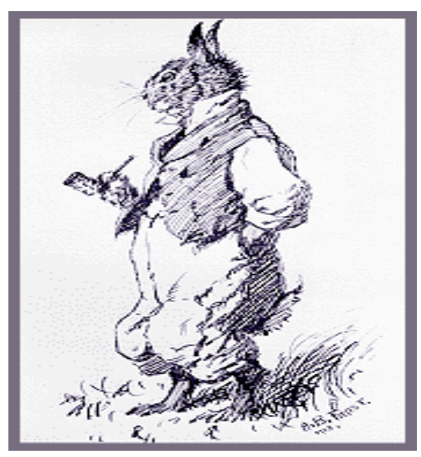
Figure 9:Brer Rabbit has become the Master; the social hierarchy has been turned over and so he smokes peacefully.