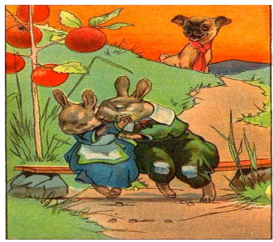
Figure 2: As we can see in this picture animals can act in the same way as humans.

German fable critic, established that there is a close relationship between animals and human beings.