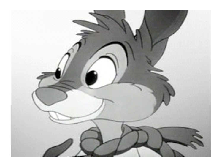
Figure 4"Dat was endurin'er de dog days. Der er mighty wom times, dem ar dog days is" (Nights, "Old Grinny Granny Wolf":347)<sup>2</sup>

We may interpret the "dog days" as an era when the crudities of existence for black people are most apt to justify the tricks: