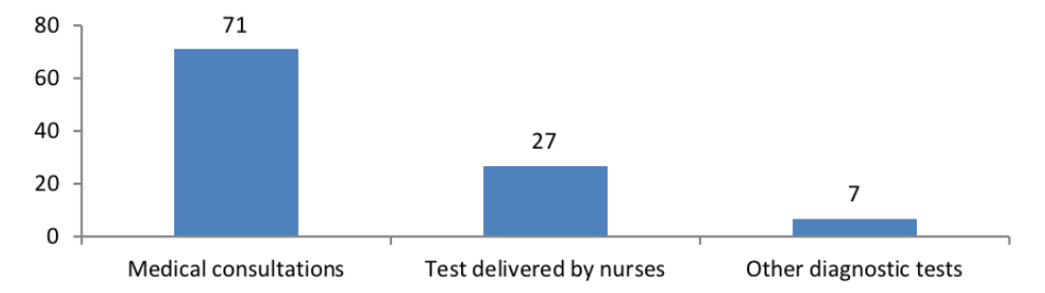
Figure 2. Interpreter-mediated interactions between patients-doctors/nurses/other HCPs* (n=105) * HCP = Healthcare provider

Healthcare interpreters of the sample took part in 336 events. As shown in Figure 2, 105 events (31.25 %) involved interpreter-mediated interactions between non-Spanish speaking patients and Spanish-speaking doctors, nurses or other healthcare providers. Interpreters also participated in 231 events (68.75 %) beyond medical consultations and diagnostic tests, as revealed in Figure 3. These activities include accompanying patients, waiting with patients, managing administrative procedures, delivering stool and/or urine samples and requesting stool and/or urine collection containers. A preliminary observation that can be drawn from our data is that most events in which interpreters participate occur outside consultation rooms, which calls for more focused research on the healthcare interpreter's role outside medical encounters.