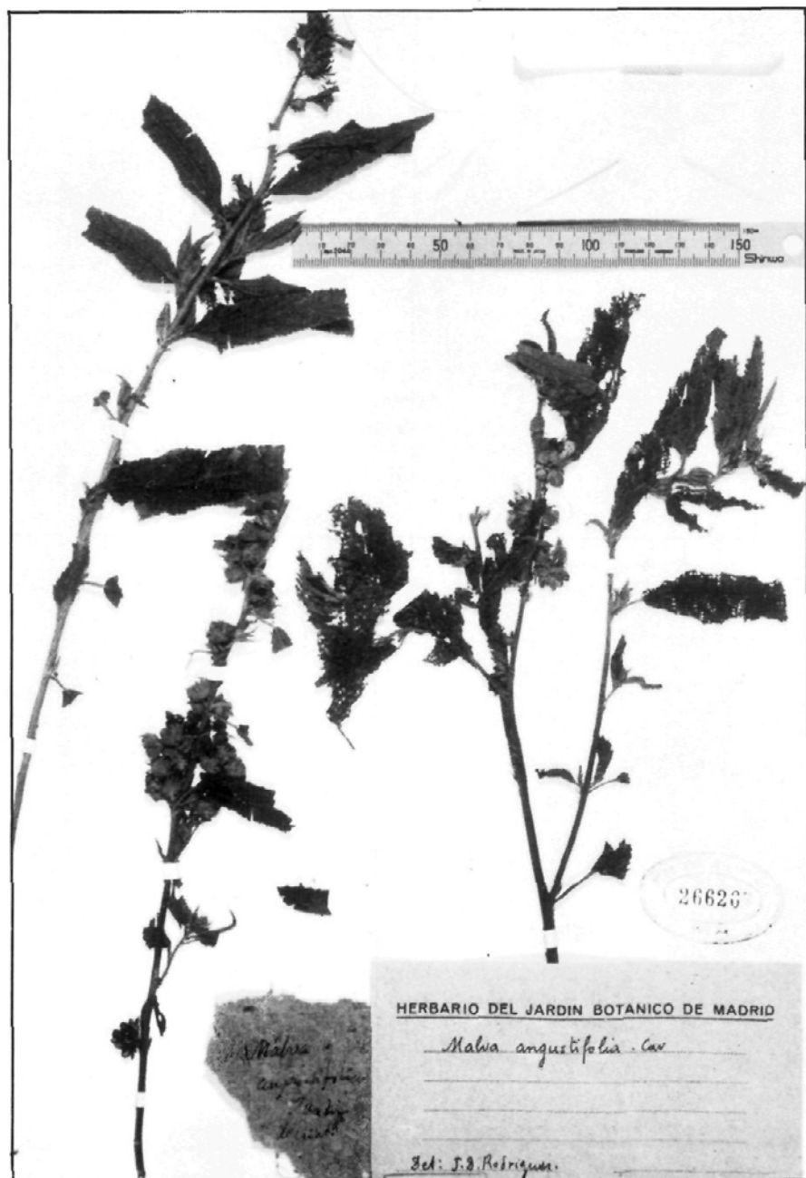
Fig. 3.—Specimen of M. angustifolia from MA. Lectotype.