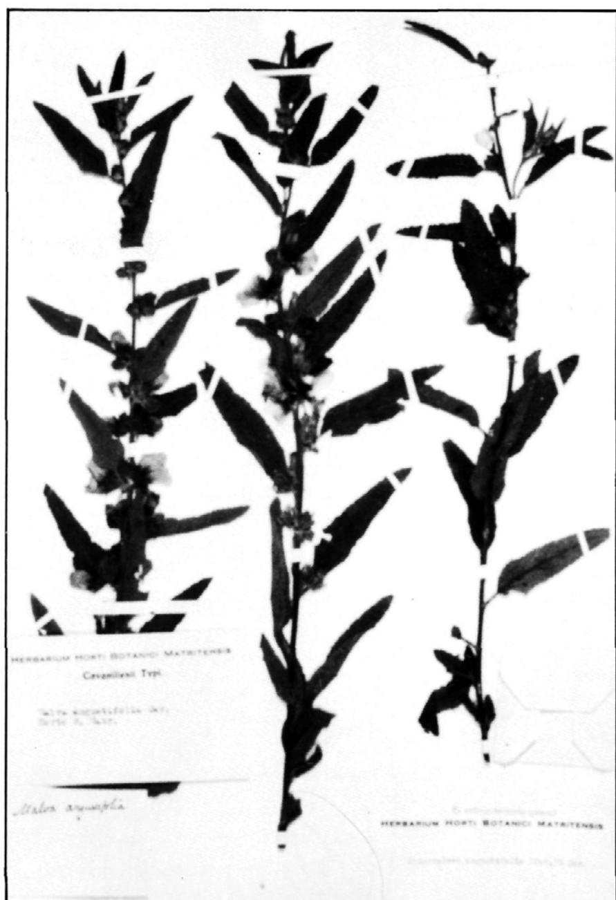
Fig. 4.—Specimen of M. angustifolia with handwriting by Cavanilles.