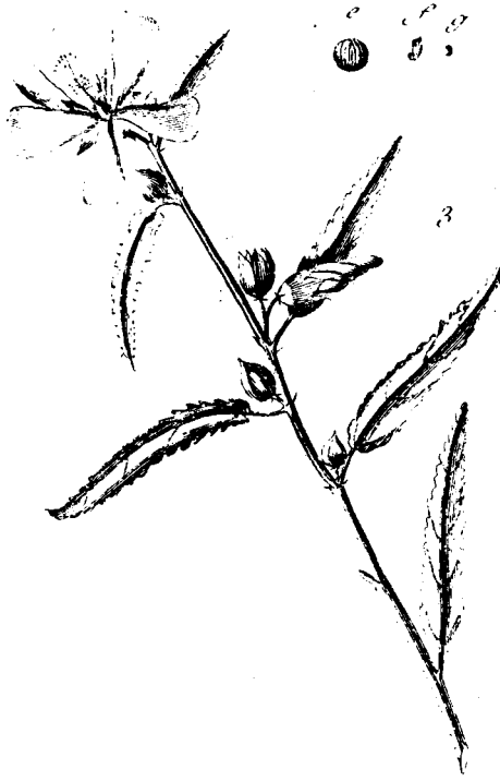
Fig. 1.—Copy of plate 20 #3 of M. angustifolia from Cavanilles (1785).

tion (fig. 2). Both specimens are M. angustifolia but neither can be attributed to Cavanilles. The specimen in figure 2a is labeled by a person unknown to us, but the handwriting is not that of either Cavanilles or Lamarck. The specimen in figure 2b has been labeled by Lamarck and has referenced the publication of M. angustifolia . We have no indication that Cavanilles saw either of these specimens before he described M. angustifolia .