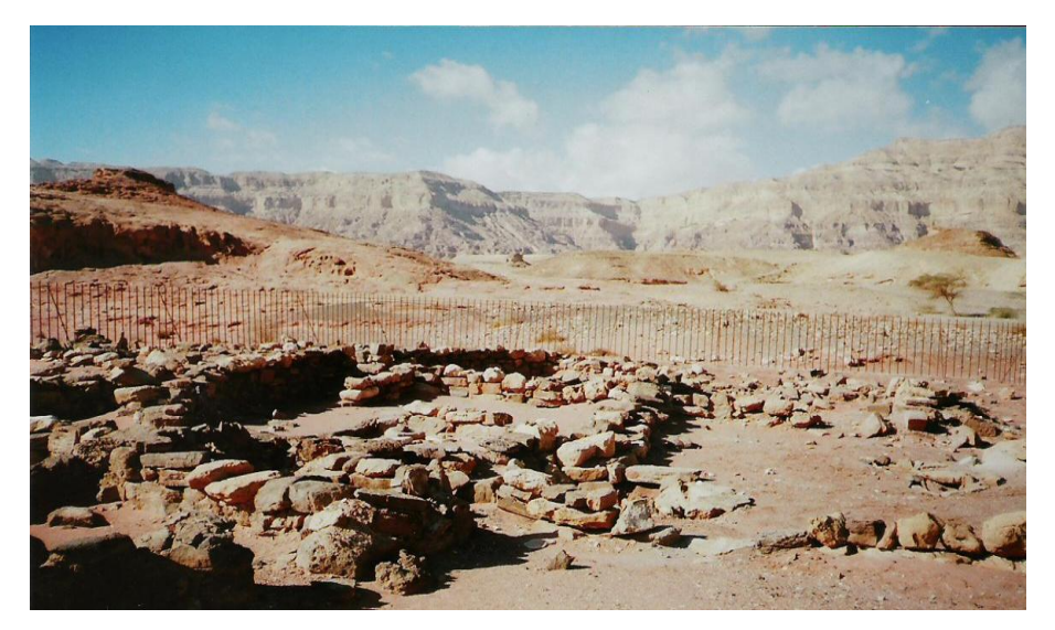
Fig. 3. Timna vallery: Smelting Site 2