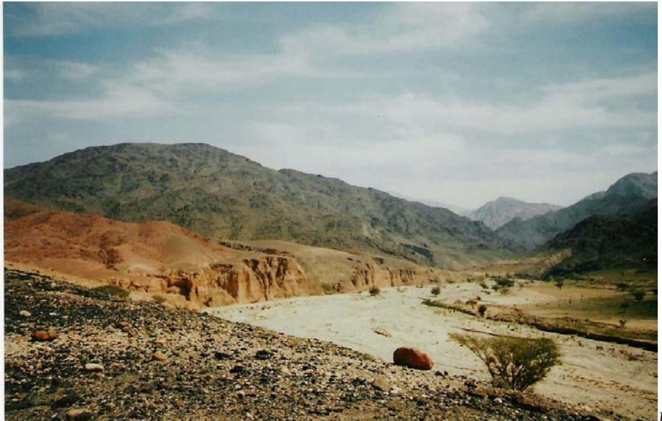
2. Wadi Faynan