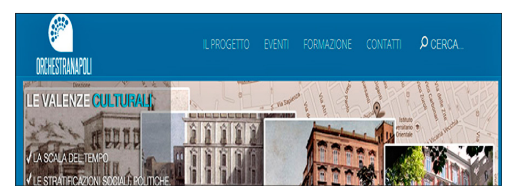
Fig. 3 – Or.C.He.S.T.R.A. Cultural information base: diachronic stratification at Sant'Antoniello (Or.C.He.S.T.R.A. website).