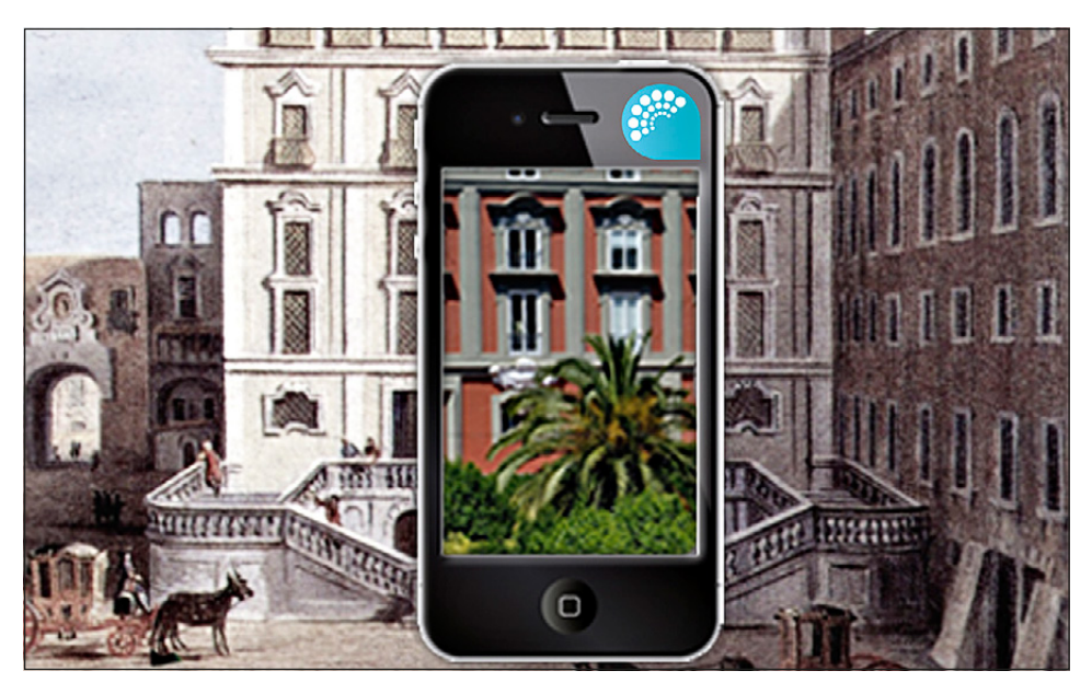
Fig. 4 – Or.C.He.S.T.R.A. Cultural tourism services: Augmented Reality at Sant'Antoniello (Or.C.He.S.T.R.A. website).

The tourist arrives at the Port of Naples and downloads one of the available Or.C.He.S.T.R.A. mobile apps, the Multimodal Navigator, which, fitting the visitor cultural interests for archaeology, suggests visiting the Greek walls remains inside the Sant'Antoniello monumental complex in Piazza Bellini, proposing customized multimedia information about Naples history (VALE-