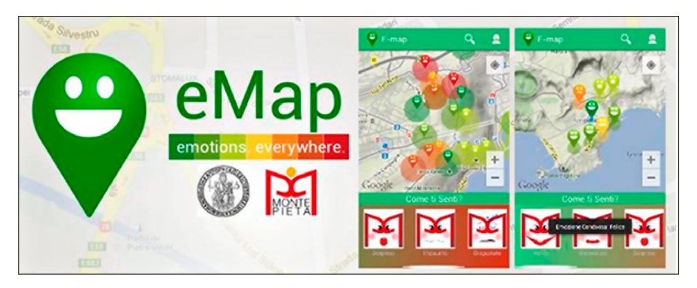
Fig. 7 – Naples emotional map.