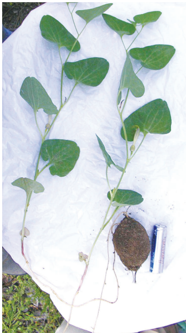
Fig. 1. An individual of Aristolochia castellana from Ávila, Casillas.

All the samples of the holo- and isotypus (Nardi, 1988) are clearly young individuals, which fail to offer a proper representation of the rootstock characteristics.