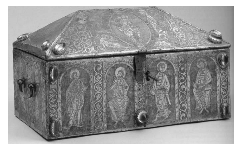
Figure 5. Casket of Saint Demetrius, Aragon, ca.1100. Gilt-copper alloy with cabochons, on wood core, 35x60x40 cm. Church of San Esteban, Loarre (Huesca).