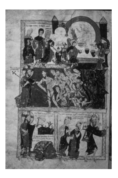
Figure 1. Scenes from the Biblia de Ávila , Spain, second quarter of the 12<sup>th</sup> century. Tempera on parchment, 585 x 385 mm. Biblioteca Nacional, Madrid, Cod. Vit.15-1, fols. CCCXXIII r. and CCCXXIIII v.