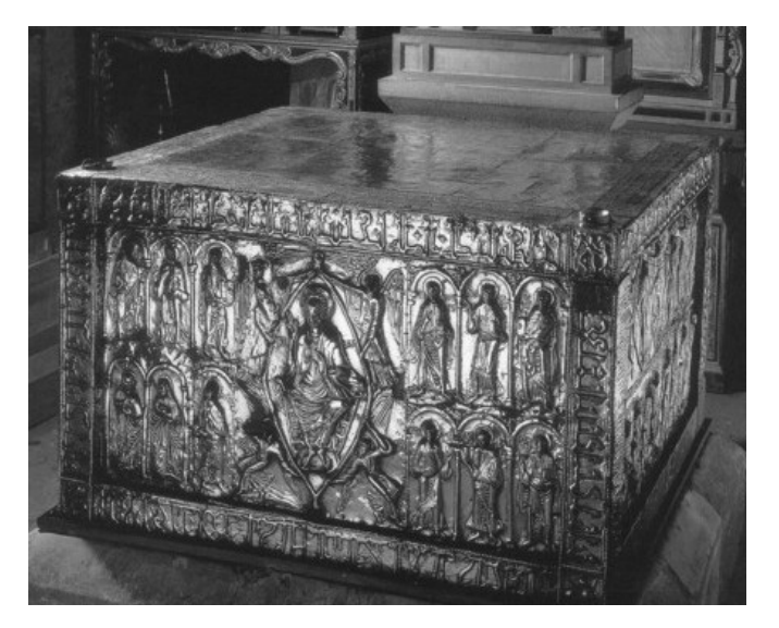
Figure 6. Christ in Majesty, Arca Santa of Oviedo (Oviedo), late 11<sup>th</sup> century or early 12<sup>th</sup> century. Black oak and gilded silver, 73x119x93 cm. B) Cámara Santa, Oviedo Cathedral.