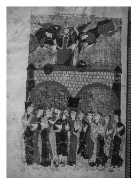
Figure 2. Second Coming of Christ, from the Biblia de Ávila, Spain, second quarter of the 12th century. Tempera on parchment, 585 x 385 mm. Biblioteca Nacional, Madrid, Cod. Vit.15-1, fol. CCCXXV v.