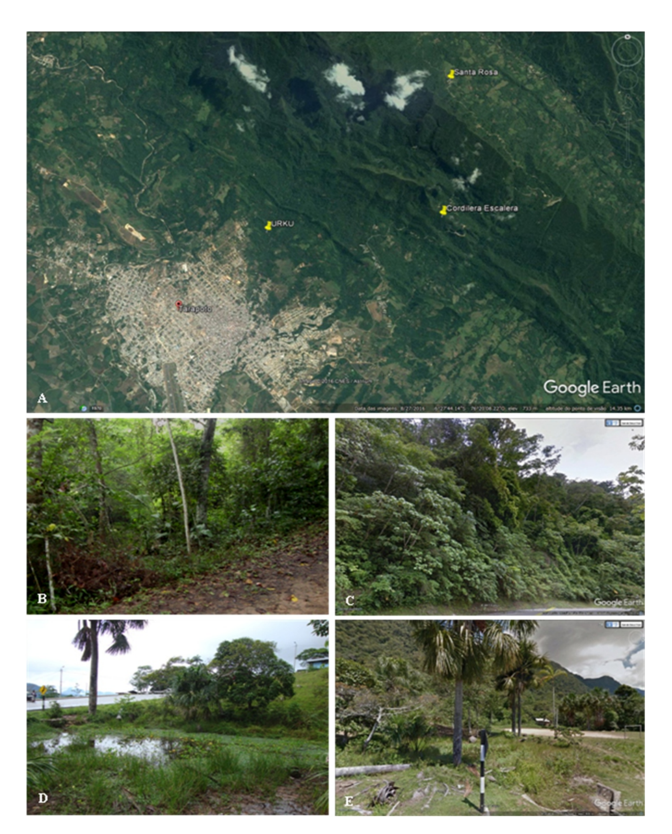
Figure 1. Geographical location of anuran sampling landscapes in the municipality of Tarapoto, Peru. A) Visualization of host sampling landscapes; B) Area of trail in the reserve URKU – Amazonian Studies (preserved environment); C) Forest of the Reserve Cordillera Escalera (preserved environment); D-E) Pond in Santa Rosa (anthropized environment). A, C and E, source Google Earth.