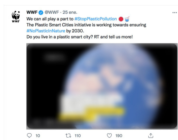
Figure 5. WWF’s Tweet on Plastic Smart Cities

In the case of Figure 5, the video included has no sound and, therefore, could not be specifically used to practice listening skills. However, many other tweets containing videos with music and oral explanations could become the object of listening activities. Students could be asked to watch the video and orally comment on it to practise listening and speaking or to answer a series of written questions about the clip to practice writing. Apart from this, as multimodal ensembles themselves, some videos also contain examples of the gestural mode, which express significant paralinguistic meanings that students need to be aware of according to curricular demands. Similarly, these videos make very innovative use of spacing and visual elements such as colours, as in Figure 5, in which WWF probably avoids