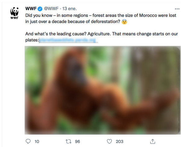
Figure 2. WWF's Tweet on Deforestation

Considering the similarities concerning written comprehension, it could be argued that bringing into the classroom those reading practices that EFL students typically carry out outside—such as consuming tweets—