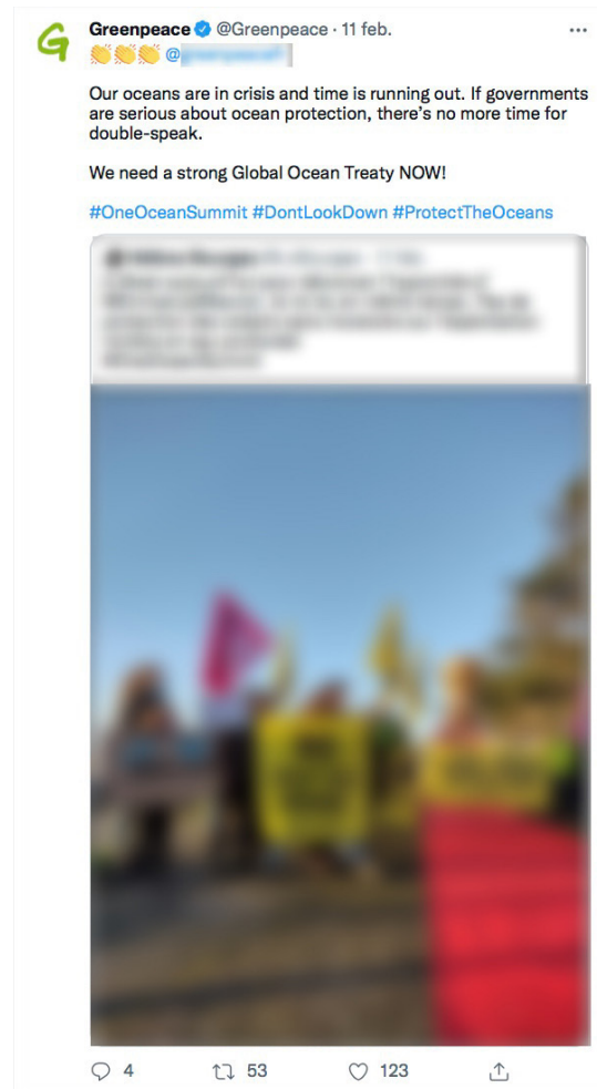
Figure 3. Greenpeace's Tweet About Ocean Protection

could teach them how to read more comprehensively and become competent internet users. This latter idea of educating competent users relates to the curricular requirement of fostering students' digital competence by teaching them how to filter information in the digital net. This translates into making students aware, first, of their exploitation of digital affordances such as hashtags as information sources and, second, of the risks of not using these digital means critically, thus contributing to developing critical thinking skills.