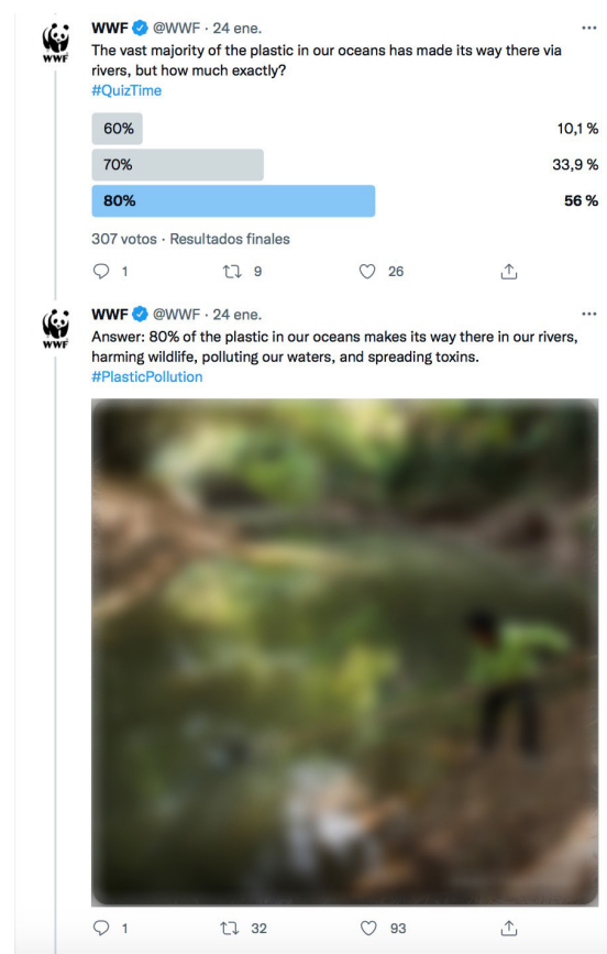
Figure 1. WWF's Tweet about Plastic Pollution

Among the different competencies to foster, the most apparent connection in content comes with developing mathematical and scientific competence, as students may need to interpret scientific data and terminology from environmental issues. For such interpretation, students must uphold a critical analytical position, believed to be the essence of critical thinking, one of the skills included in the KSAVE model. See, for instance, Figure 1. Based on this image, students could be asked to reflect on the tweet's statistical data (percentages) and hypothesise the reasons behind the amount of plastic reaching the ocean through rivers.