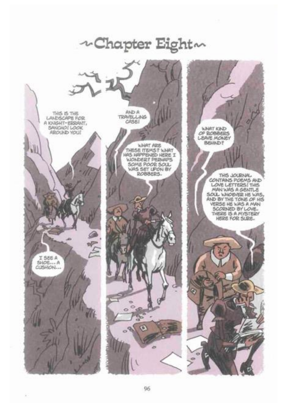
Figure 1. Don Quixote and Sancho arrive at Sierra Morena (Cervantes and Davis. The Complete Don Quixote, 96).