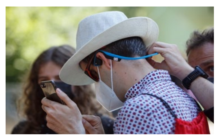
Figure 3. Visually-impaired pilgrim

The project promotes the accessibility of widely-used mobile applications, focusing its efforts on the National Geographic Institute app, and publicizing apps designed for the orientation and guidance of people with disabilities, such as Blind Explorer and Microsoft Soundscape.