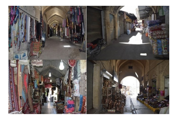
Figure 1. Some Internal Views of the Kermanshah Traditional Bazaar (Bazzaz-ha Bazaar, Allaf-Khaneh, Seraj-ha Bazaar, and Mesgar-ha Bazaar)

This requires an exact exploration of all social and physical dimensions of this bazaar's body about each other and their interaction in the mechanism of effect on the regional flourishing and consecutively sustainable security. Therefore, this would be an effort to present some architectural strategies to enhance the level of social sustainability specific to the regional community.