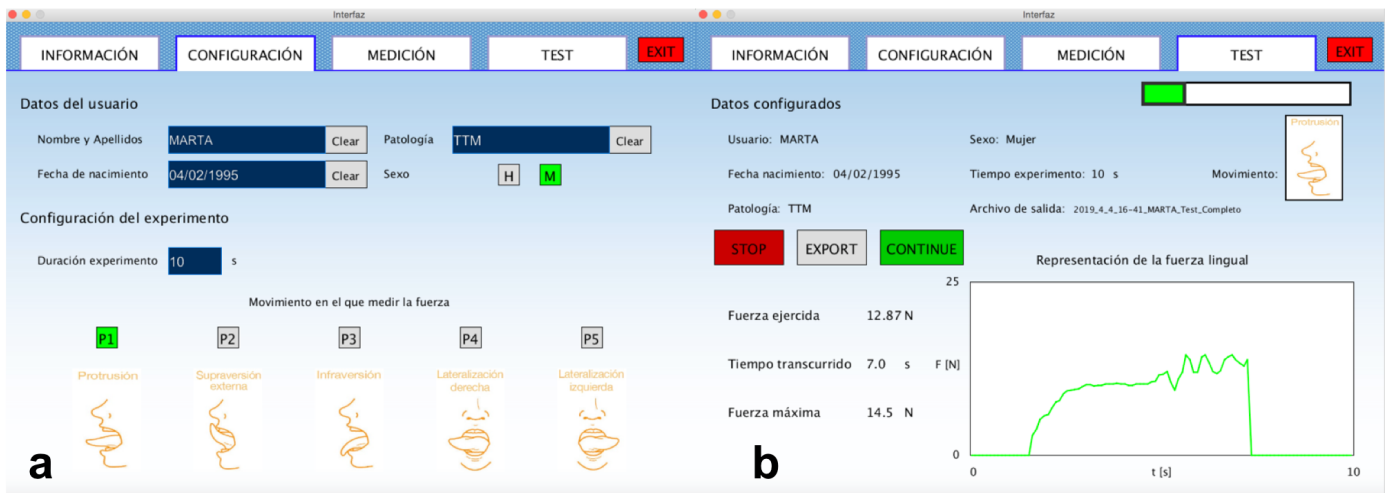
Fig. 1. Spanish prototype device interface view. a: Configuration screen view; b: Measurement screen view.

During measurements on subjects, a single-use hypoallergenic