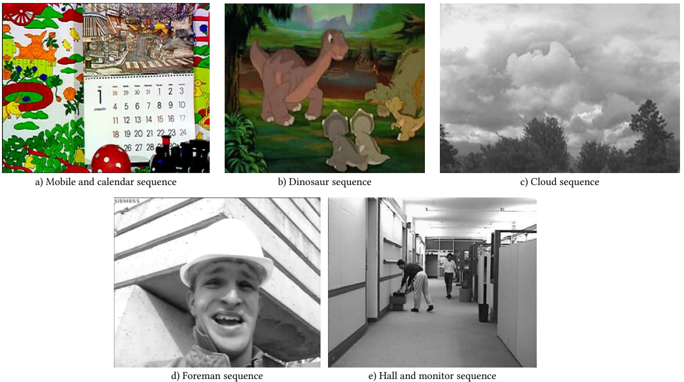
Fig. 3. One of the frames of video sequences.