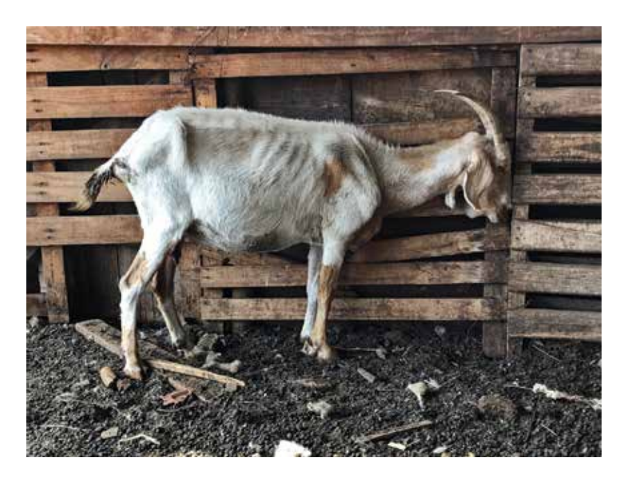
Figure 3. Adult female goat, which presents loss of body condition, respiratory difficulty, and skull pressure 84 h post-ingestion of feed administered in troughs

There were no alterations in size and morphology at the hepatic level. Histopathological lesions included marked multifocal necrosis of contractile myocardiocytes with heterogeneous coloration, pale and eosinophilic areas, pycnotic nucleus, rupture of myofibrils, mild lymphoplasmacytic infiltration, incipient fibrosis areas in more affected areas, and structures compatible with Sarcocystis spp (Figure 4 A-B). In the lung, edema and mild diffuse interstitial hemorrhage were found. In the kidney, interstitial hemorrhage and mild tubular degeneration with the presence of intraluminal cell debris were found. In the reticulum, rumen, omasum, and abomasum, mild mononuclear inflammatory infiltrate, hyperemia, congestion, and bleeding in the lamina propria were also noted. Hepatocytes, hydrophilic and vacuolar degeneration was found in the centrilobular area. During the inspection of the farm, N. oleander leaves were found mixed with the other forage in the troughs. Some of them were green while others were dry, and they showed evident marks of having been chewed.