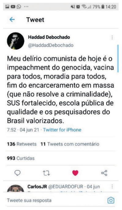
Figure 2: First week tweet

Figure 2 was selected because, besides of the vaccine, it deals with other agenda already clearly defended by "Haddad Debochado" through his choice for the pseudonym, the avatar, the biography sentence and the cover.