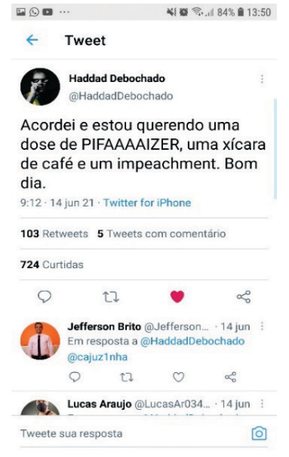
Figure 3: Second week tweet

In June second week, on the 14<sup>th</sup>, at 9:12 a.m., the following tweet was published, according to Figure 3.