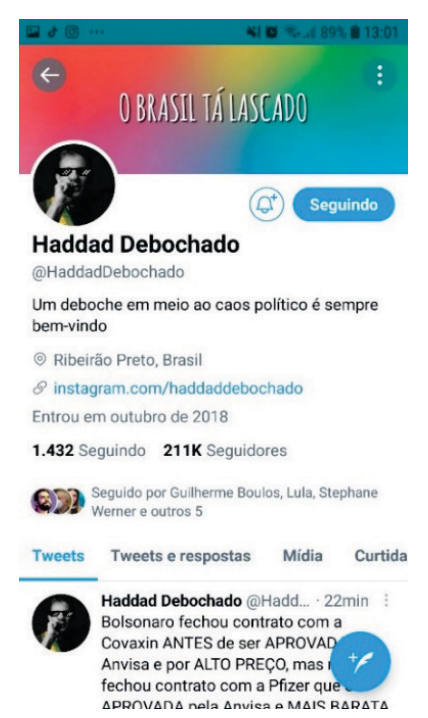
Figure 1: Profile "Haddad Debochado" on DSM Twitter

In this screenshot, firstly, we can identify some tracks of one of the researchers through some icons at the top part of the screen, such as the type of connection used (Wi-Fi), the battery level of the device used, the telephone signal, the exact time of the screenshot, notification icons of other DSMs, as well as the technical affordance in blue (standard theme of this ecosystem) "Following", which evidences that the researcher follows the profile analyzed.