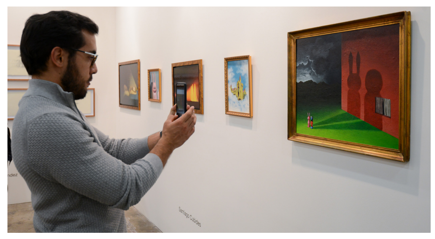
Imagen 1. ArtBo (2018).

by the new trends. Without alluding to the current terminology of op art and kinetic art, Seitz coined the term perceptual art, which exalted the perceptual value of art and the visual process involved in creating it (1965). Focusing on the psychophysical studies of the late nineteenth century and Gestalt theory, Seitz combined different artistic movements that favored the study of perceptual phenomena and used them to vindicate the role of the observing eye (1965). This new label of perceptual art allowed Seitz (1965) to gather a selection of artworks organized under six headings, which grouped examples from European optical and kinetic art and examples of American postpictorial abstraction. Although the concept failed to gain traction in other scholarly works at the time, The Responsive Eye marked the beginning of the internationalization of optical and kinetic art and its spill-over into the worlds of fashion, television, and film. The multiplication of the op art phenomenon, as it was generally called, confronted viewers with a specific visual experience who were intentionally provoked by these objects (Borgzinner, 1964). The inclusion of the viewer at the center of the aesthetic experience was also part of the claims of other trends, such as the happening, the Fluxus movement, and conceptual art, which revealed the importance that the viewer had acquired in the avant-garde culture of the time.