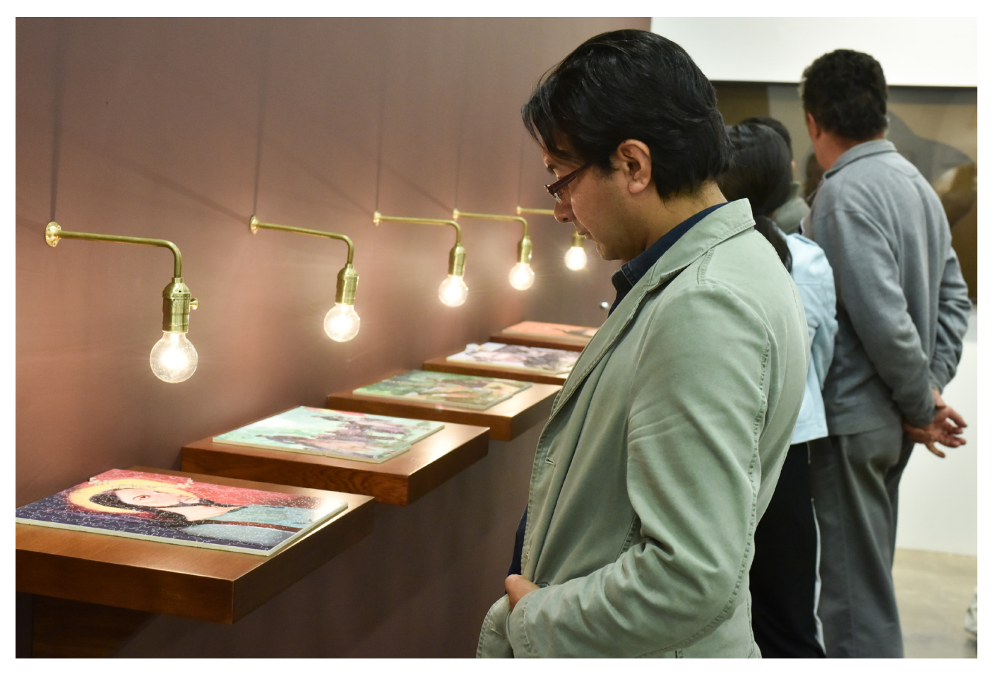
Imagen 2. ArtBo (2018).

Alpers extends Baxandall's approach to seventeenth-century Dutch painting. Her study focuses on the visual culture of the Netherlands, an expression she claims to take directly from Baxandall. For the author, Dutch painting must be studied by appealing to the circumstances. In this regard, Alpers proposes not only seeing art as a social manifestation but also accessing images through the consideration of their place, role, and presence in culture in broader terms (1984). The analysis of art then becomes a reasoned study of society and of the perceptive conception existing at the time, in clear relation to the scientific advances and psychological investigations of the time. By considering these new parameters, Alpers goes beyond the traditional sources of research anchored in the iconographic method and opens a new field of study that surpasses the framework of the artwork to consider the visual culture of the moment.