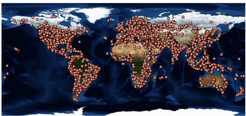
Figure 1. Origin of visitors

Now, if we analyze JOTSE's internationalization with the number of visited of JOTSE's website (410,814 visits between November 4th, 2015 to January 20th, 2022), we can observe in the figure 2 the distribution in the wold with Philippines, US, Indonesia and Spain in the first positions.