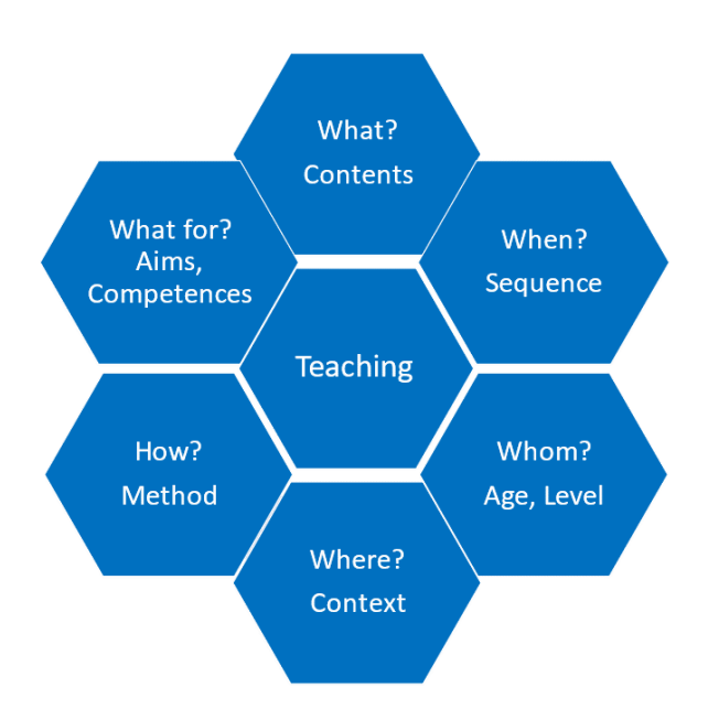
Figure 2. Key elements in teaching planning

Purpose: Which are the aims and competences?