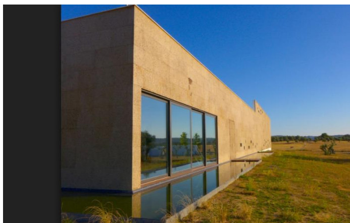
Figure 4 – Ecorkhotel

energy to heat the main building and swimming pools and solar panels to heat the water used throughout the hotel and both swimming pools. Being a 100% natural product, cork is the most important element in the main building, as well as the involving landscape. Ecorkhotel uses cork as its coating, becoming one of the rare examples of buildings in the world who have this feature and the first to do so in the hospitality sector. Using cork in the exterior part of the building, works as a thermic and acoustic isolator and allows for an exceptional energetic efficiency as well as a natural touch to the building itself. The hotel was planned and built having maximum energetic efficiency in mind.