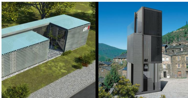
Figure 3 – Tourist Transportable Tower

Its physical dimension and inner space is optimised with resort to the prevalence of a harmonious and integrated relation with the outer surroundings. The present technology establishes an innovative timber-glass composite constructive system in which the combination of these materials simultaneously assumes energetic, structural, functional and aesthetic character. The system materialises through a multipurpose modular panel, able to be applied horizontally – as slab – or vertically – as sustaining wall. It integrates passive solar systems and bioclimatic functions, which results in energetic efficiency, thus constituting a clear innovation in terms of prefabricated structural elements (DST, 2013).