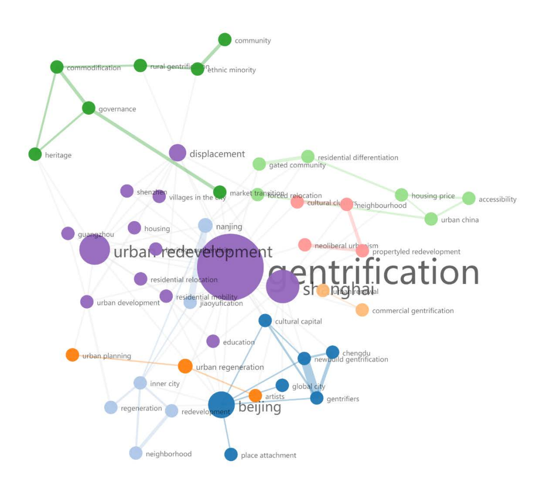
Figure 2. Knowledge graph based on the keyword analysis