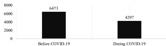
Figure 1. Weekly energy expenditure of physical activity, expressed in MET minutes/ week (metabolic equivalents), in university athletes, before and during the COVID-19 confinement.