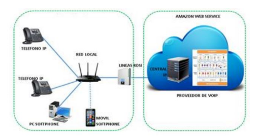
Figure 4. Architecture on the functioning of the IP telephony in the cloud.

In Figure 4, it shows our case study where it was selected as server provider from the cloud to the company Amazon Web Service installed in the Elastix IP(central), the same that connects to the local network to use the VOIP system in the cloud. This technology has the advantage that operations that are performed throughout the network are more secure and robust through a single platform voice and data services.