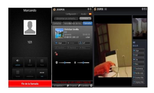
Figure 5. Call test / successful video call.