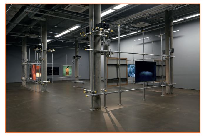
Figure 8. Material Sight 2018. Northern Gallery for Contemporary Art, Sunderland. UK.

observed and constructed imagery as with the 'fly-through' animation that Professor Mark Swinbank's team produced of the famous Hubble Ultra Deep Field image; the film starts with the original (still) Hubble image, densely-packed with ten thousand galaxies and then animates the image back through time, with the galaxies reducing in number as we move back toward the origins of the universe. 12 The film formed a compelling point of exchange within the Material Sight project because it took an image that was directly observed, albeit remotely and in a composite of several hundred exposures, 13 and expanded it through imaginative conjecture into temporal and spatial dimensions that we cannot observe or experience directly. The ICC generously gave permission for the fly-through animation to be edited together with the film Boulby to form one of the four moving image screens within the Material Sight exhibitions, allowing for the two radically remote 'environments' to be juxtaposed – the aurally assaulting, embodied presence of Boulby being cut-edited with the suspended, silent abstraction of the Hubble animation, travelling back to the origins of the universe.