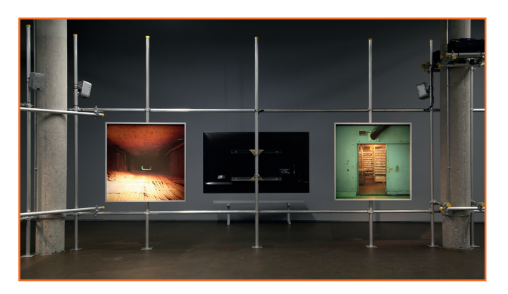
Figure 1. Material Sight 2018. Northern Gallery for Contemporary Art, Sunderland, UK. Installation Detail. ©Fiona Crisp

Our attempts to connect to the spatial and temporal scales of fundamental physics - from the subatomic to the multiverse - often provoke a form of perceptual vertigo, especially for non-scientists. When we approach ideas of paralysing abstraction through the perceptual range of our sensing bodies, a 'phenomenological dissonance' can be said to be invoked, between material presence and radical remoteness. This relational dynamic, between materiality and remoteness, formed the conceptual springboard for Material Sight (Crisp 2018), <sup>1</sup> a research project based at three world-leading facilities for fundamental physics, that brought to fruition a body of photographic objects, film works and immersive soundscape that 're-presented' the spaces of fundamental physics as sites of material encounter [Figure 1].