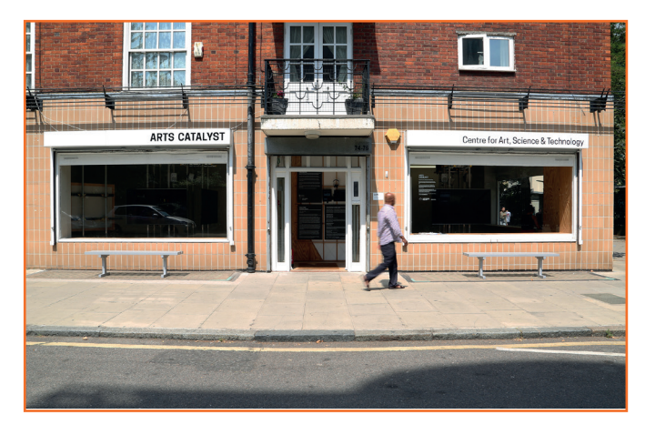
Figure 9. Material Sight 2018. Arts Catalyst Centre for Art, Science and Technology, London, UK.

Whereas the production of imagery in Material Sight was premised on knowledge built through the camera's act of looking, the exhibitions themselves sought to foreground the visitor's experience of phenomenological encounter. The first exhibition was designed and built for the cavernous, hermetic space of the Northern Gallery for Contemporary Art (NGCA) in Sunderland, UK [Figures 1 & 8] and the second installation created a completely re-configured set of structures for the permeable, street-side galleries of Arts Catalyst Centre for Art, Science and Technology in London [Figures 9 & 10]. At both sites, scaffolding structures were built into the architecture of the spaces, wrapping round pillars (NGCA) or bracing floor to ceiling (Arts Catalyst) to support film screens, photographic works, speakers, wiring, media players and amps. Within this integrated sculptural apparatus, all elements were considered as an entity, resulting in the scaffolding structure and technical equipment being presented together with the photographs and