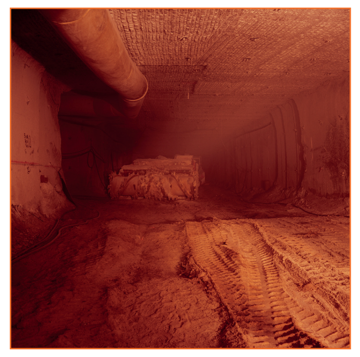
Figure 2. Joy 3 Continuous Miner from Material Sight 2018. Giclée print from colour transparency.

nological encounter. This article plots the key conceptual coordinates of Material Sight and looks at how the project's methodological design – essentially the production of knowledge through the act of looking – emphatically resisted the tendency of art to be instrumentalised as an illustrative device within scientific contexts.