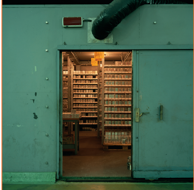
Figure 6. LNGS: Opera Archive from Material Sight 2018. Giclée print from colour transparency.