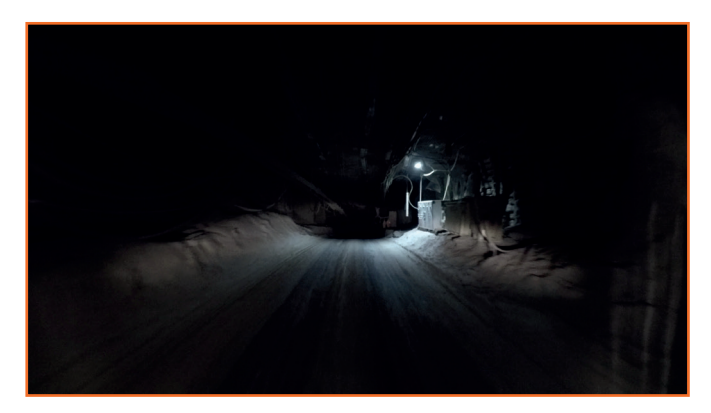
Figure 5. Boulby 2017. Film Still, single-channel digital video. ©Fiona Crisp

alike, not as illustrations of the technical sublime, that distance and remove the viewer, but as sites of phenomenological encounter that an audience experience physically as well as intellectually. Accessing Boulby Underground Laboratory is above all else a physical experience. After donning full protective clothing there is the long descent into the mine via a lift cage shared with the mine workers. The rapid descent creates intense noise and air-pressure and on disembarking at the shaft base the dust and oppressive heat of the mine tunnel system is striking. It is, in effect, a journey to another world and indeed the extraordinary geology and environment of Boulby is close enough to that of Mars for the laboratory to be established as an international 'analogue site' for testing instrumentation such as remote landing vehicles for the future exploration of other planets.