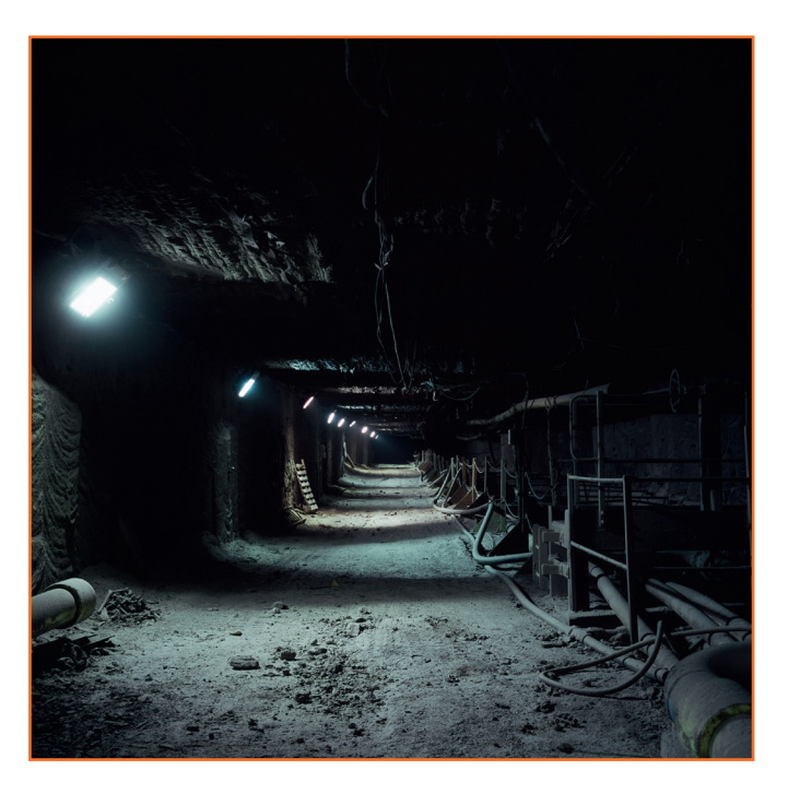
Figure 3. Pump Lodge from Subterrania 2009. Giclée print from colour transparency.

time or space, were either destabilised or suspended altogether. The Catacombe Series [Figure 4], for example, were taken using pinhole cameras with large-format analogue film; apart from the anachronistic presence of modern safety lighting, these particular catacombs have been in a state of stasis for hundreds of years and the stability of light and climate are absolute. In many ways the resultant photographs represent a tautology, insomuch as they are still images captured of spaces that are, essentially, already still, already 'dead.' Within the three hours taken to expose the large-format film of the pinhole negative, an indeterminate time is opened up between "sometime" and 'no-time,' and, similarly, in the suspended identity of place, a space is created between 'somewhere' and 'nowhere'; an impossible space.