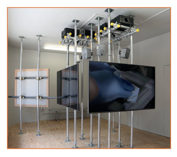
Figure 10. Material Sight 2018. Arts Catalyst Centre for Art, Science and Technology, London, UK.

The core question of how the radical remoteness of fundamental physics could be countered through an experience of embodied encounter – how big science can be made intimate – was central to the public manifestation of Material Sight . To this end the exhibitions sought to create a sensorium, not only through visual and formal means but via a combination of haptic connection and intense aural experience: within the installations the individual soundtracks from the four separate films were synchronized to form an immersive, spatial soundscape that served to 'choreograph' the visitor's movements around the scaffolding screens and towers, sometimes building to pitches that overwhelmed the body, sometimes stopping abruptly and producing an equally intense feeling of ringing silence. A series of seven benches, designed and fabricated for the exhibitions, became points of stillness and focus, affording the visitor a haptic encounter with the temperature of the seating's steel surface, provoking a simultaneous sense of distance and intimacy<sup>14</sup>.