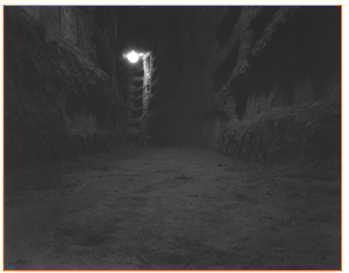
Figure 4. Catacombe #13 2001/2. Archival pigment print on cotton rag from blackand-white pinhole negative.

Subterrania was a touring exhibition comprising several groups of large-scale photographic works made within underground locations across the UK and mainland Europe. The sites ranged from a German military hospital in the Channel Islands to the Early Christian catacombs of Rome, spanning across geographies, histories and time-frames, but the spaces shared a common ontological root insomuch as they were all interior architectures, formed through excavation and with no exterior. Within these hermetic environments, many of the 'rhetorical forms' (Townsend 2009) of photography, such as light,