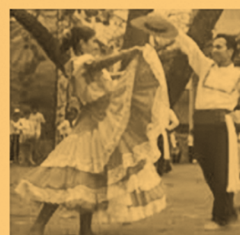
Artes Folkloricas | Confección de artesfolkloricas.com.co