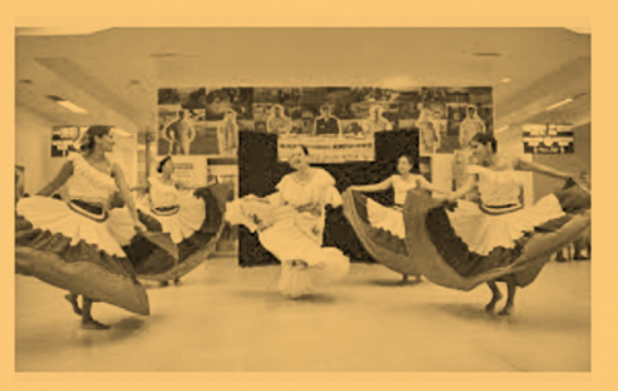
Bailes típicos de Colombia por regiones: de la c... viajejet.com