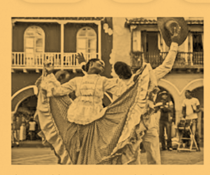
La cumbia es una mezcla de la m...