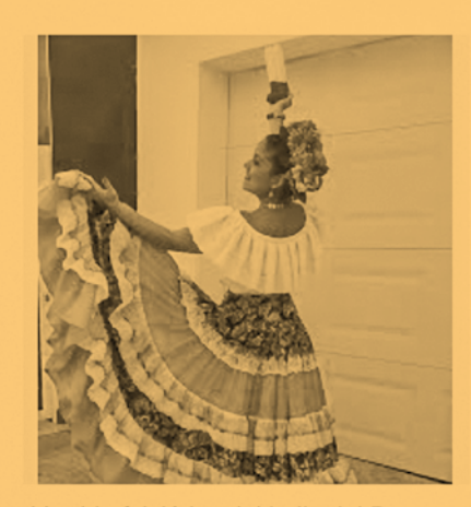
Vestido folclórico del baile del Porro...