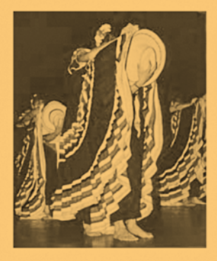
Musica colombiana, cu... colombia-sa.com