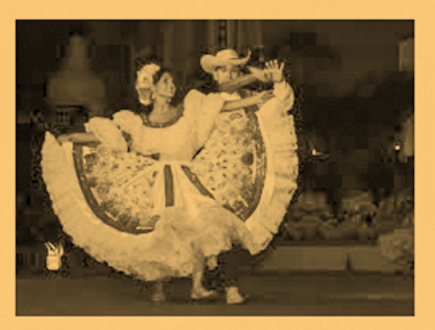
Generos :: BANDA FIESTERA FACATAT... banda-fiestera-facatativa.webnode.com.co