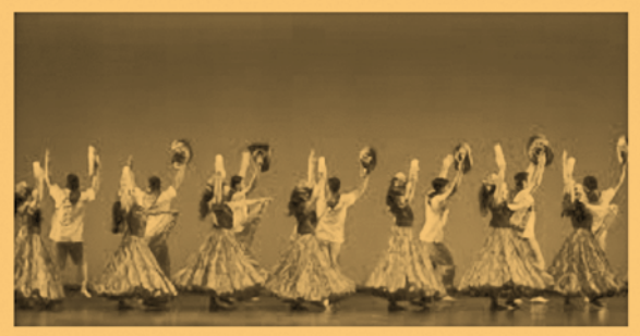
Herencia Viva se presentará en el Teatro México e... eltiempo.com