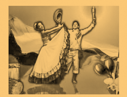
BAMBUCO - MAGC musicajfr.jimdo.com