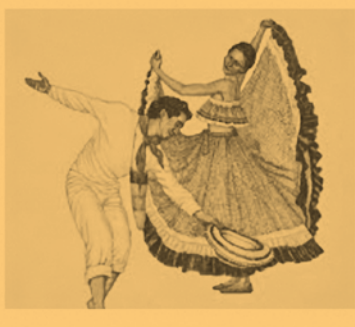
Ritmos Musicales de Colombi... asesoriacomunitariacali.wordpres...