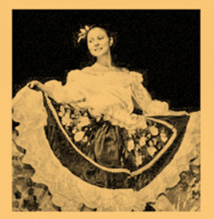
Colombia Tierra Queri... pinterest.com