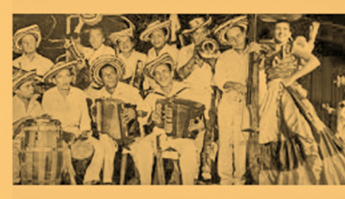
CUMBIA – PORRO: Y otros aires hermanos | portalvallenato.net