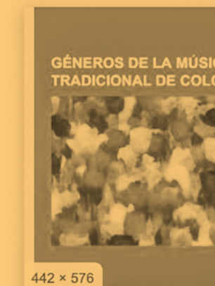
Generos de la Musica Tra jet.com