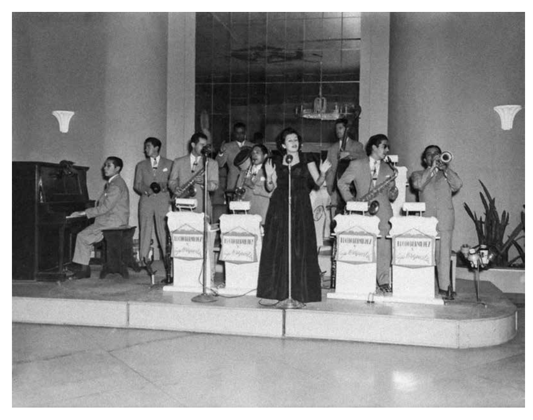
Imagen 1. Lucho Bermúdez's orchestra at the Nutibara Hotel in Medellin, 1948.

perform the instruments in the military bands.<sup>16</sup> It also allowed, on the other hand, the simultaneous existence of different formats that have remained associated with popular expressions in a sort of double life that did not prevent acceptance, a priori, in any of the opposite social circles. This divergence from the process of the center of the country proves itself decisive for the survival of the genres in the cultural dynamics of the popular classes. One of the most obvious examples of this situation is the corralejas, events that allowed the encounter of social groups antagonistic by principle. The corralejas, a popular hybrid of Spanish bullfights and the famous encierros of San Fermín, is one of the first spaces where the brass band, paid for by the big breeders, performed without shame all genres in a relaxed, festive atmosphere, in large open spaces that required instrumental ensembles that were strong enough to reach as many participants as possible.