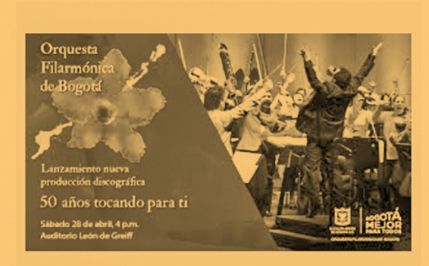
Orquesta Filarmónica de Bogotá on Twitter: "El próxi... twitter.com