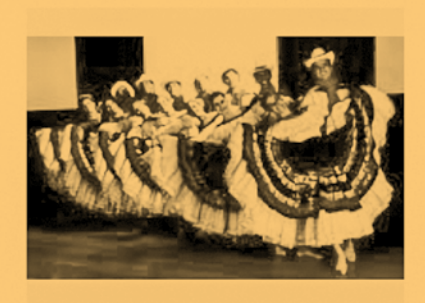
Musica colombiana, cumbias, sal... colombia-sa.com