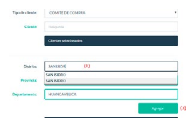
Figure 03: Reverse logistic for data retrieval during data entry for geographical locations

We advocate for a bottom up approach when retrieving data from geographical location database. - e.g. typing the root of the location. We only need any graphical control element intended to enable the user to input text information, e.g. a text box, text field or text entry box, dropdown combo. They are always available in every programming language and web design forms.