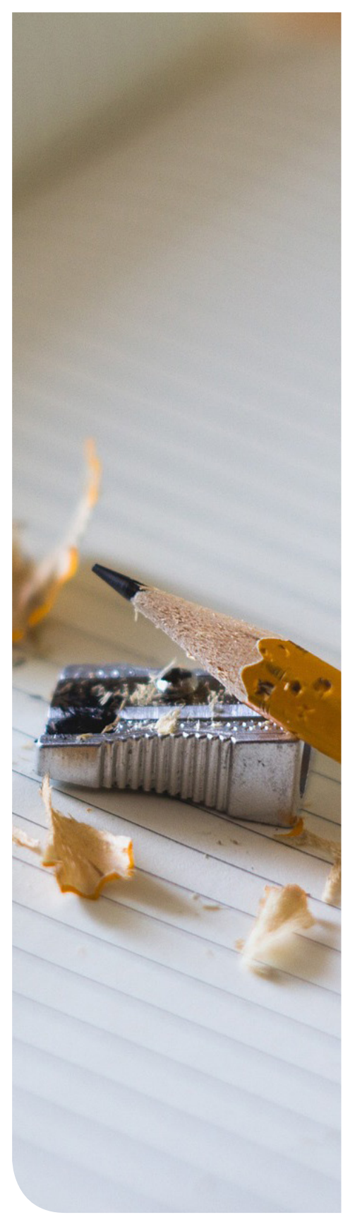
Figura 1: Sin título, fuente: Pixabay.

Ben-Porath (2006) offers an important criticism of peace education that brings the issue into greater focus, and helps to explain why peace education has not – and possibly cannot – succeed in gaining support for principles and practices of conflict transformation. She argues that peace education typically is "all too often based on definitions that are either too broad or too narrow" (p. 74). Peace educators, Ben-Porath claims, tend toward either a "pedagogic approach" or a "holistic approach." Those favoring the "pedagogic approach" focus on development of "identifiable capacities" for violence reduction and consequently share a rather modest vision