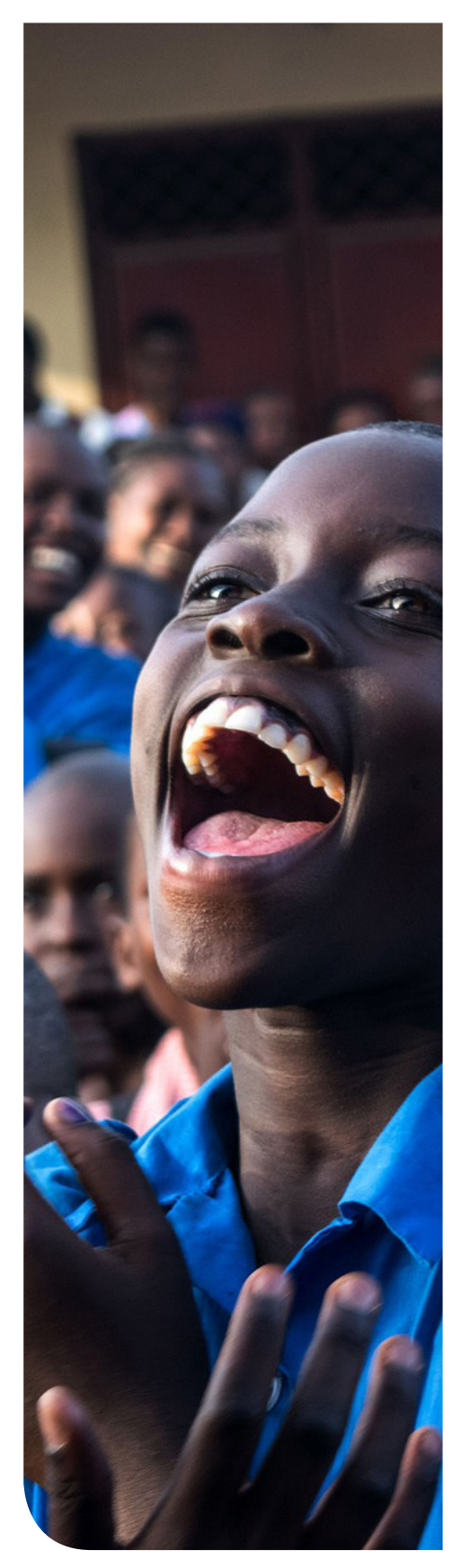
Figura 2: Sin título, fuente: Pixabay.

During the final stages of the same project, University of Duhok trainers developed and delivered workshops on peacebuilding thought to faculty from the University of Mosul who were displaced to Duhok because of Mosul's continued occupation by Da'esh. This cooperation between public universities — one of them operating under the authority of the Kurdistan Regional Government's ministry of higher education and the other answering to Iraq's federal ministry of higher education — served as a significant public signal about possibilities for cooperation across the political divide even while remaining out of