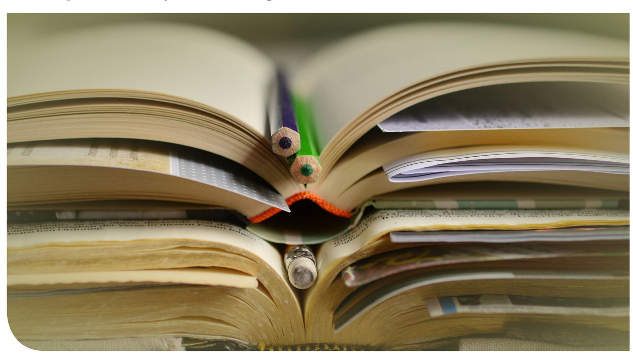
Figura 3: Sin título, fuente: Pixabay.

and ideas are likely both to be generated and to be transferred effectively to the policy process." Envisioning Kelman's interactive problem solving as an educational process provides a model for how CTE might play a role in shifting societal norms in the direction of conflict transformation. Although inclusion of CTE at all levels of formal and informal education might seem to be a worthwhile objective, focusing on learners with the greatest likelihood of applying its lessons to policy development would be a better use of resources. As Lederach (2005) argues, "[i] n social change, it is not necessarily the amount of participants that authenticates a social shift," but rather "the quality of the platform that sustains the shifting process that matters" and that "the focus on numbers has created a misunderstanding and misapplication of the concept of critical mass" (p.89).