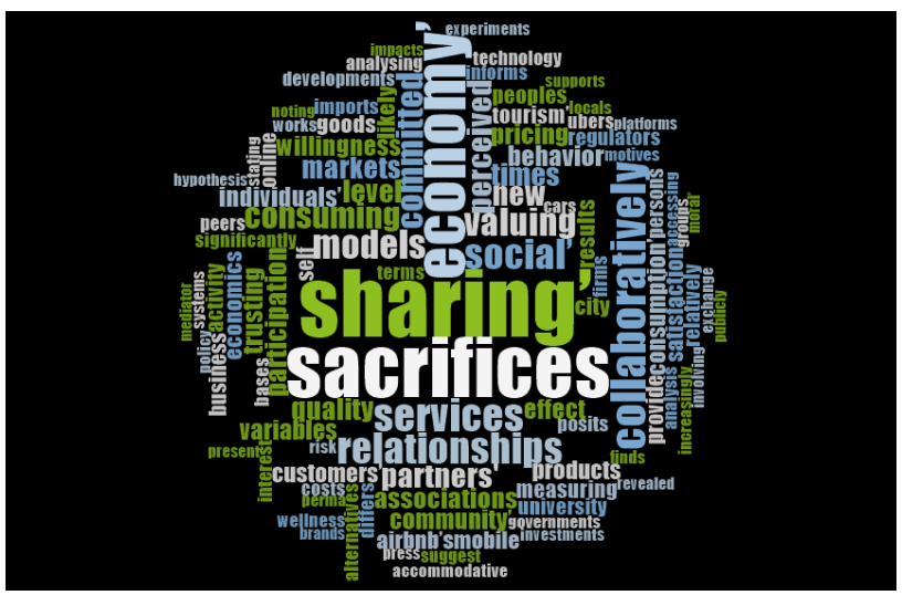
Figure 1. Word Cloud from the 30 papers analyzed using text mining

To analyze these papers, we used the text mining approach. To do so, first it is necessary to structure the entire database removing all articles, prepositions, non-meaningful verbs and words. Then, we plotted the word cloud presented in Figure 1, this word cloud captures the essence of the analyzed database.