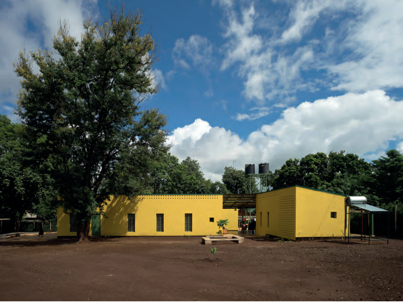
Fachadas del proyecto