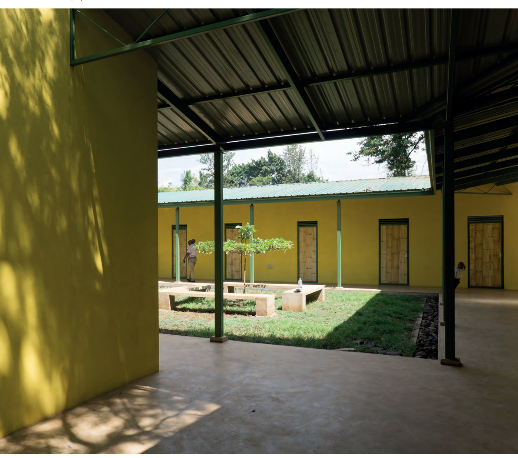
Patio del proyecto