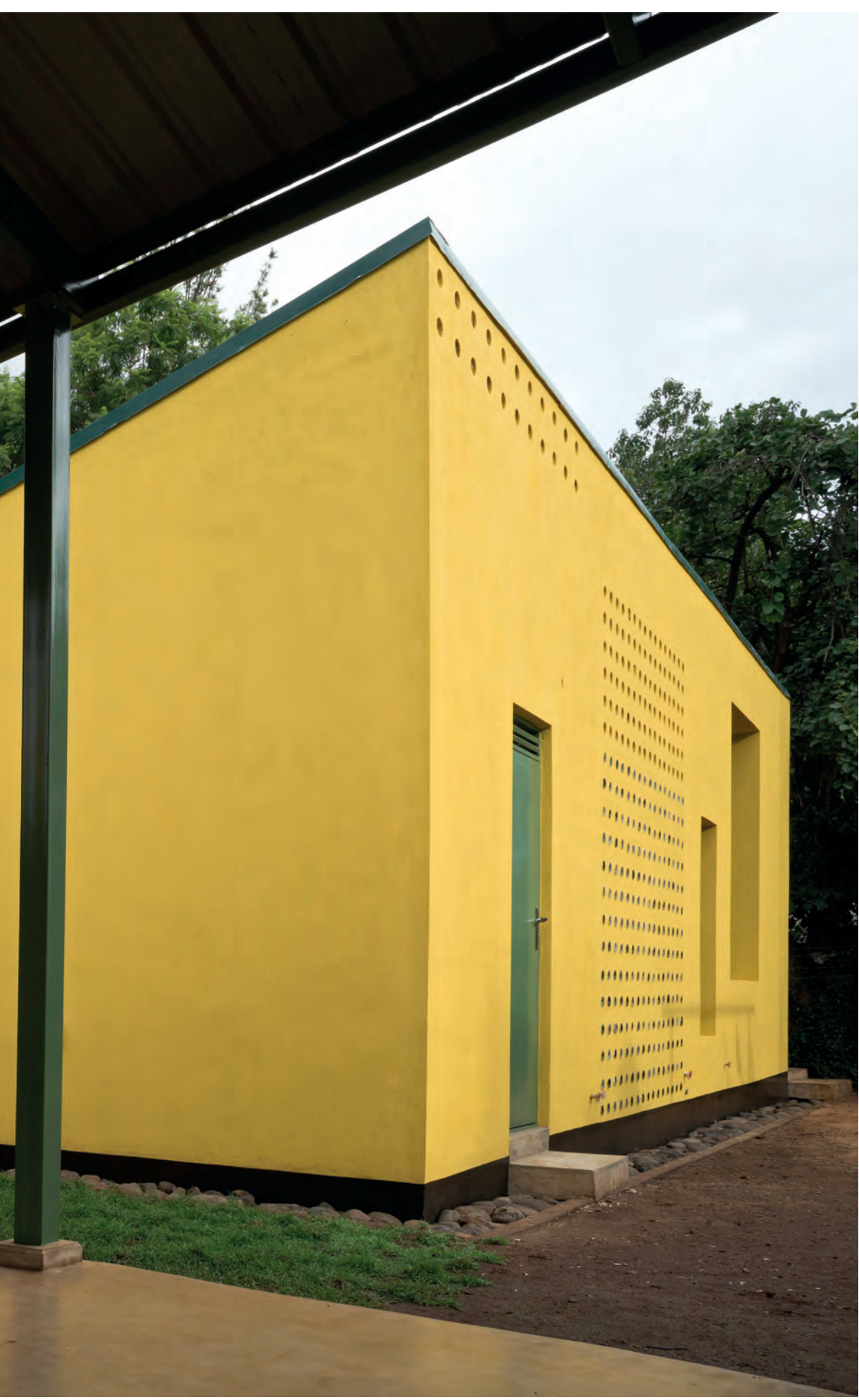
Circulación y patio interior