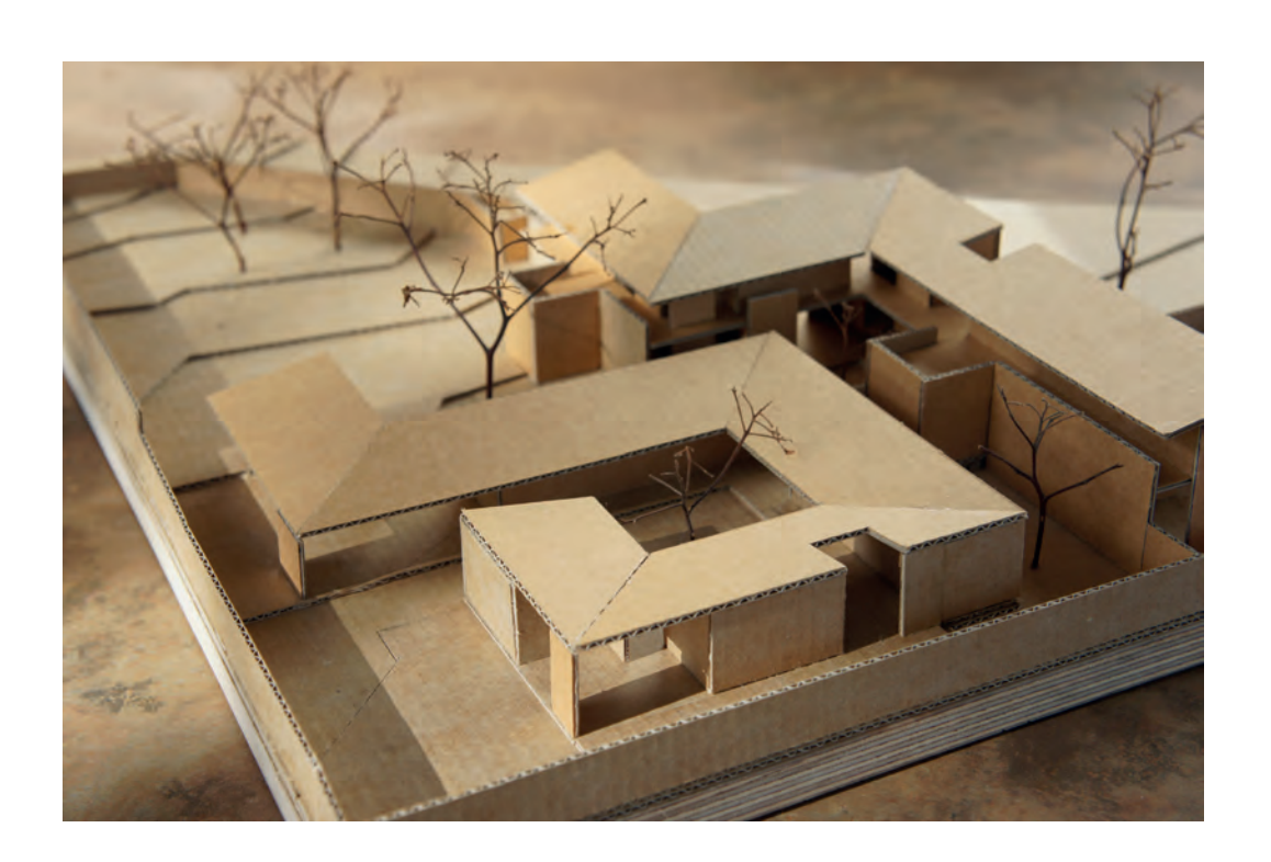
Maqueta del proyecto