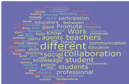
Figure 2. Evaluation of the Council/Observatory innovation by students