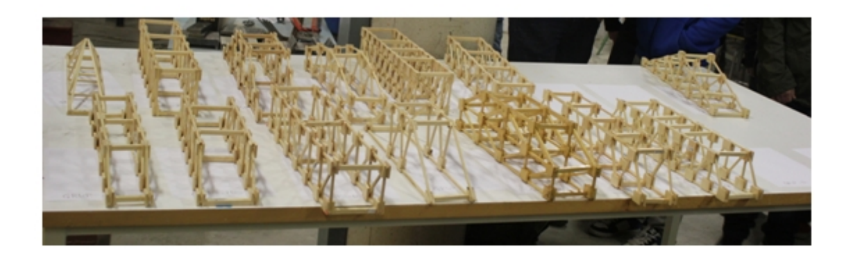
Figure 2. Bridges tested during the first edition of the project

There were two aspects to the project evaluation. On the one hand, the activity was evaluated based on the poster and oral presentation given by each team of students. This score formed part of the total course grade. On the other hand, the teams were rewarded that obtained the best experimental result, understood as the effectiveness ratio of the maximum load supported by the bridge and its own weight. The reward consisted of extra points on the final exam, as long as at least 4 points over 10 were earned on the exam. The three best teams in each category (classic and innovative) were rewarded. Table 2 shows the results of the effectiveness ratio for the two editions held so far. It can be observed that the result in the classic category increased from 0.77 to 0.84, while the result in the innovative category dropped, due to an exceptional result of 1.55 obtained in the first edition of the project.