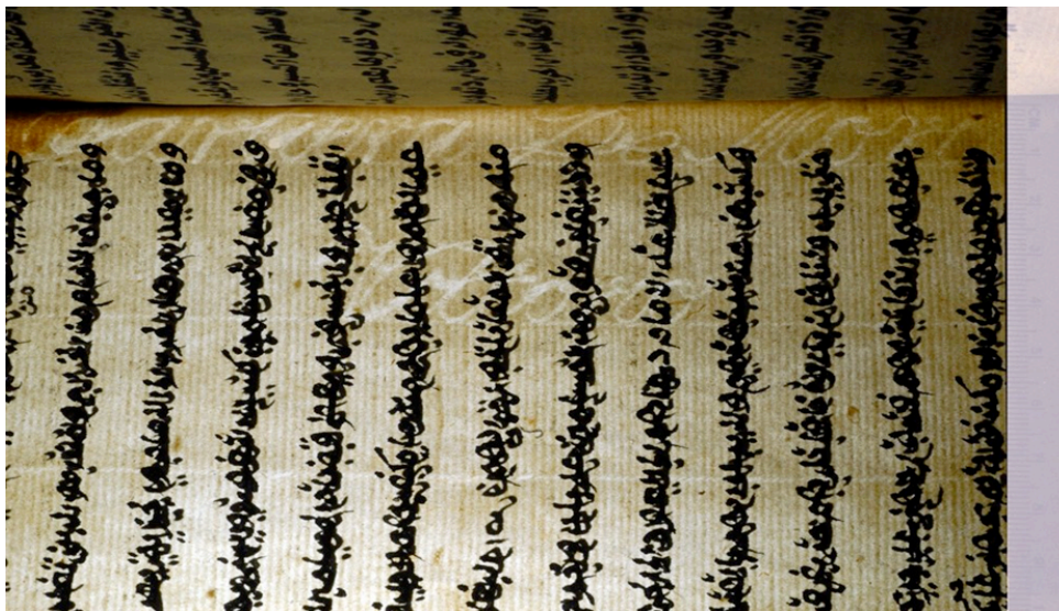
1.a.b. Watermark and countermark, Italian paper Cartiera de Mori Vittorio .

The manuscripts which have been catalogued were produced between the middle of the 17th century, and the 1980s. The authors of the texts are, themselves, of various periods and origins: it is thus that these collections can be said to be, in part, medieval; nevertheless it is a very tiny part. 5 It is difficult to prove conclusively as the compilation of a statistical table for the manuscripts of the region would be an enormous task, but it certainly reflects the situation of the majority of Yemeni and African private libraries.