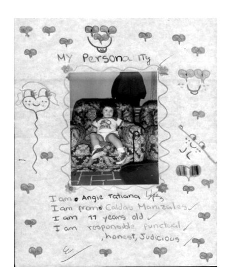
Photo 1. A sixth grade talks about herself and her values in the EFL class.