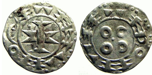
Fig.1: Private collection

Following is an example of the denier of Melgueil (cf. Fig.1)