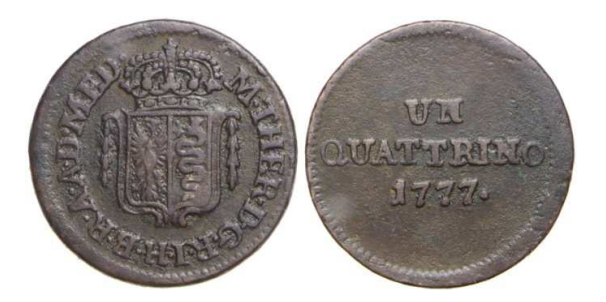
New coinage, quattrino, Maria Teresa of Austria, Milan mint, 1777 Prov. Private Collection

The quattrino would make a comeback in 1777 and 1779 as more modern coin based on the Austrian monetary system. This was due to the introduction of modern coin presses and the modernization of the mint. This new quattrino coin was to be preceded by a 1776 pattern only known today by two existing specimens; one in the collection, Papadopoli-Aldobrandini and one in the Museum of Berlin.