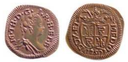
Collection Pietro Verri, Milan, n.630