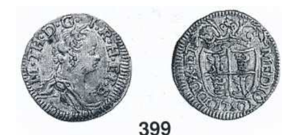
Auction XXXI Numismatica Varesi, 26 – 10 -1999 , lot 399