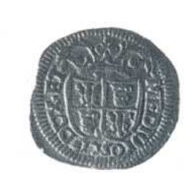
Auction Tevere Numismatica Filatelia, 1994, lot 418