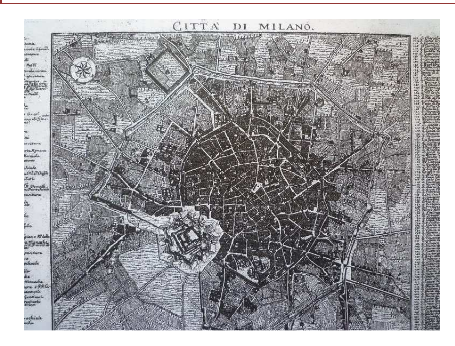
Map of Milan in 1734

In numismatic terms the Spanish rule is often regarded as the cause of the monetary chaos prevalent in the city (and its inland territories). At the time, many different foreign currencies and coins and were circulating in Milan, often clipped or made with poor or debased silver alloy.