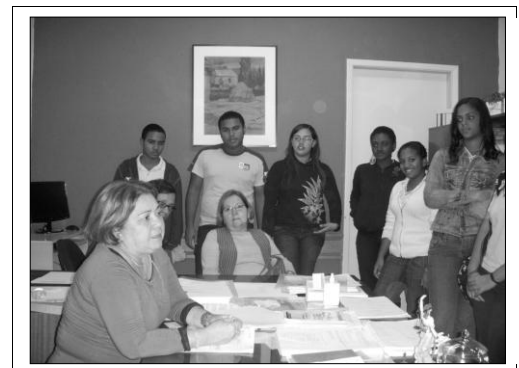
Image 1 - Presentation on the University and the EEAP, at the EEAP's Principal Room

We have highlighted some images that represent the three meetings for having a general idea.