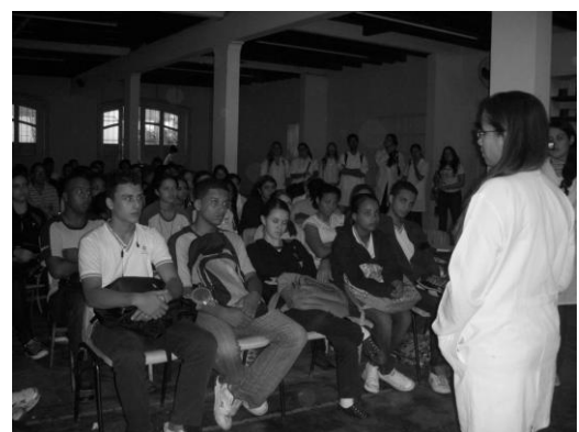
Image 2 - Academic of the 3 rd term of the Undergraduate Nursing Course aware of the asking that is being conducted by the student of the 3 rd High School grade.