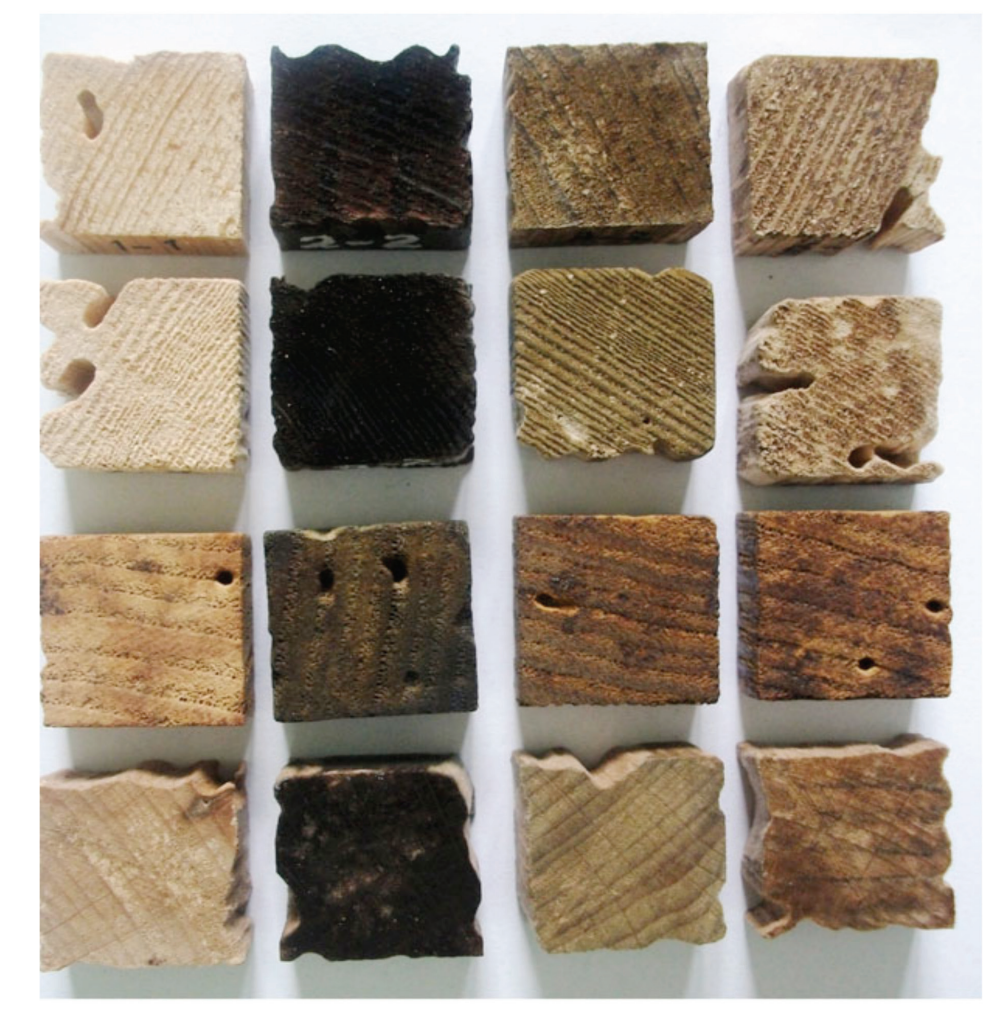
Figure 2. Visual observation of termite damage on some representative control and stained wood samples (Each row represent one species, from top to bottom; Pinus sylvestris (Scots pine), Picea orientalis (Spruce), Castanea sativa (Chestnut), Fagus orientalais (Beech), each column represents one stain treatment, from left to right; Untreated control, aniline, chemical, Van Dyke brown).

Consumption rates of stained spruce sapwood were reduced 83%, 82,2% and 72,1% for the aniline, chemical and Van Dyke brown treatments, respectively. Similarly consumption rate was degraded from 64,4 to 11,4 \mu g/termite/day for Scots pine sapwood when treated with chemical stain at 0,1 kg/m<sup>2</sup> retention level. While aniline treatment showed some reduction in the consumption rate for the same species, Van Dyke brown actually increased it. The visual representations are in line with the mass loss and termite mortality data, indicating that while the chemical stain treated softwood species display almost intact structures, the controls and other treatments were moderately or heavily damaged due to termite activity (Figure 2).