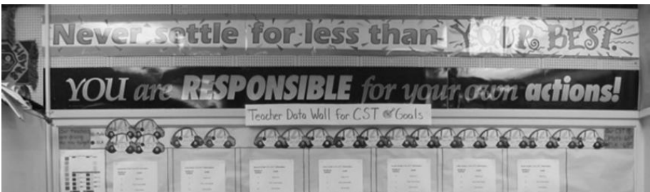
Figure 2. Image of the back of the classroom at Brinker Elementary.