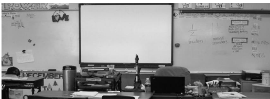
Figure 3. Image of vantage point in the classroom at Flynn Elementary.