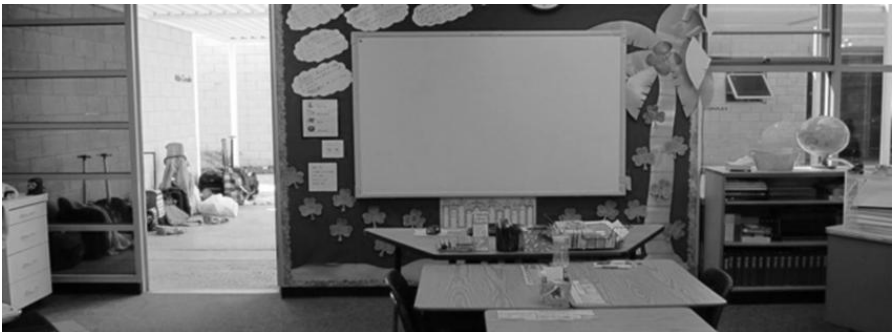
Figure 4. Image of vantage point in the Foley School elementary classroom.

The Foley School is the third and final school site in the study. Foley is a private school with predominately white students from wealthy families. The school has approximately 600 Pre-Kindergarten through 8th-grade students. Classes average 20 students per teacher, with teacher assistants in the majority of classrooms. Yearly tuition is over $16,000. The grounds at the Foley School are well cared for with lush greenery and flowers strategically placed throughout the campus; the buildings are freshly painted and architecturally appealing. Classrooms are well decorated with posters and student work. The school invests a significant amount of its funds in technology and technology education. The school offers an up-to-date computer lab, and several mobile computer stations, equipped with 20-30 laptops, that are moved from class to class depending on the teachers' needs for lessons. Upper-year students, trained in Adobe software, become familiar with architectural design software as well as photo and video editing programs. Curricula for primary and lower year students – among those whose classroom I observed – expose them to technology developmentally through learning how to use applications, navigating computer document management, and engaging in instruction via the interactive whiteboard in class.