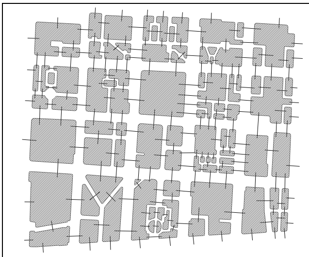
Figure 3 (top): the 203 gates were people were counted.