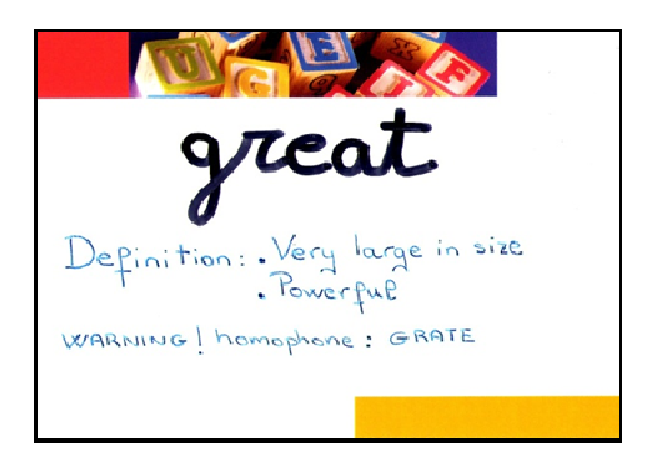
Figure 3. Card example for words box technique.

an error with a word (s)he should make a card that includes that word with other useful information (such as its meaning or similar words and so on) and place the card inside the "words box". For example, Figure 3 shows a card made for a child who wrote "grate" instead of "great". At the end of each week the child should review all the words that have been included in the box and remove those that (s)he can read and write properly (e.g.: when the child makes a spelling task without errors). The practitioner will review all the words removed often (e.g.: two months) to strengthen the learning of the words.