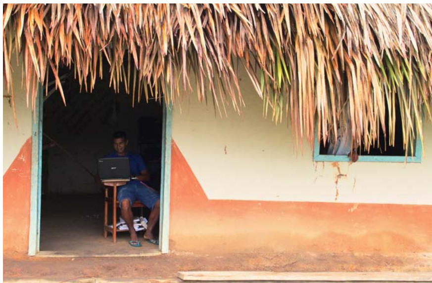
Teacher using a computer at Pamáli School