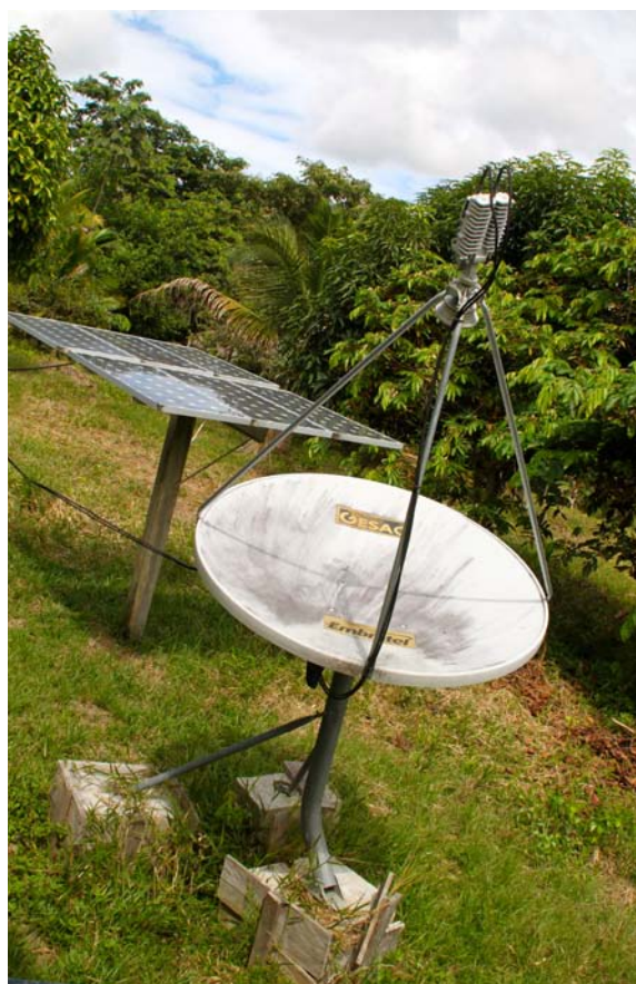
Gesac Antenna and solar panels at Pamáali School