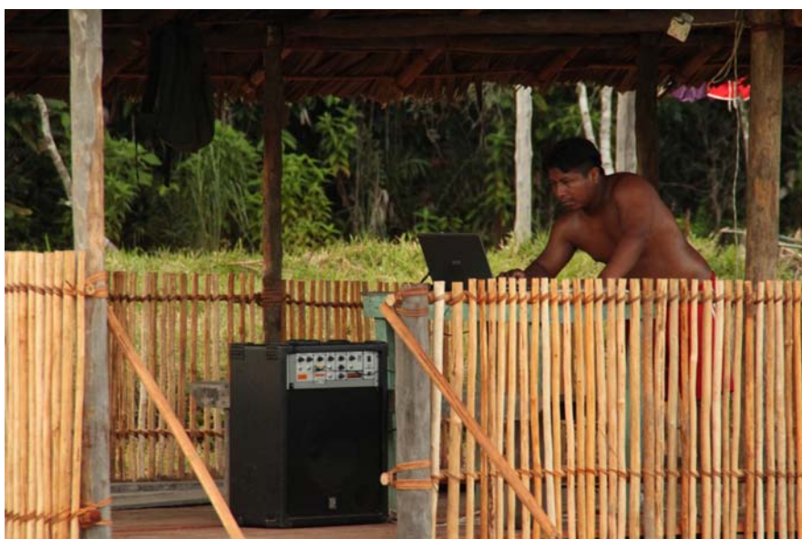
Teacher choosing a tune to be played during a soccer game at Pamáali School