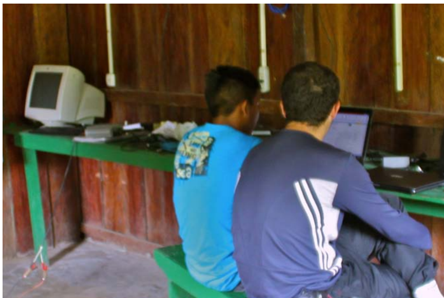
Gesac internet access point at Pamáali School