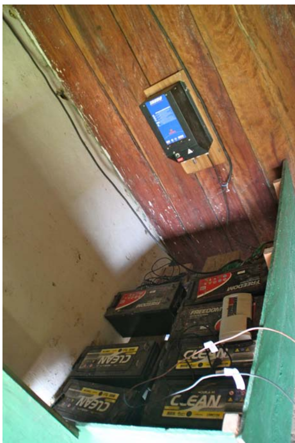
Batteries used to store solar energy at Pamáali School