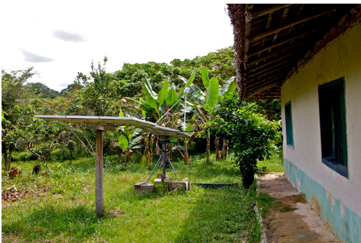
Gesac Antenna and solar panels at Pamáali School