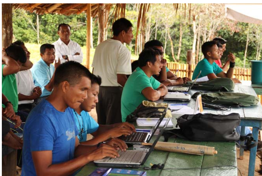
Teachers taking notes during an assembly at Pamáli School